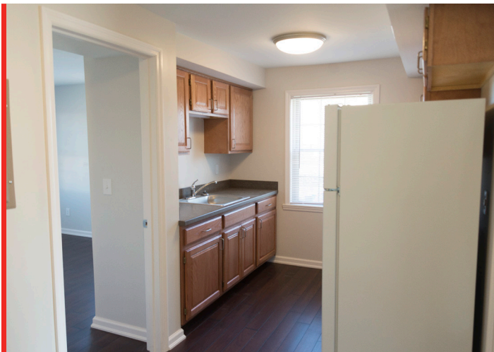
AFTER PHOTO OF KITCHEN AT 557 CORONA AVE.

Greater Dayton Construction Group is in the final stages of modernizing four 4-family buildings located at 538 Telford Ave., and 550/551/557 Corona Ave. in Kettering, Ohio.