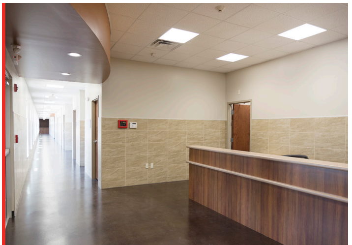
FRONT RECEPTION AREA AT PROJECT C.U.R.E.'S NEW TREATMENT FACILITY

The +/- 25,000 sqft. drug rehabilitation treatment facility — completed by OTC in June of this year — features administrative offices, client service areas, medical exam/testing areas, conference rooms, private outpatient counseling rooms, a kitchenette, and several patient waiting areas.