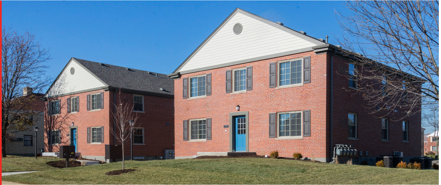
FRONT ELEVATION OF 551/557 CORONA AVE. AFTER MODERNIZATION EFFORTS