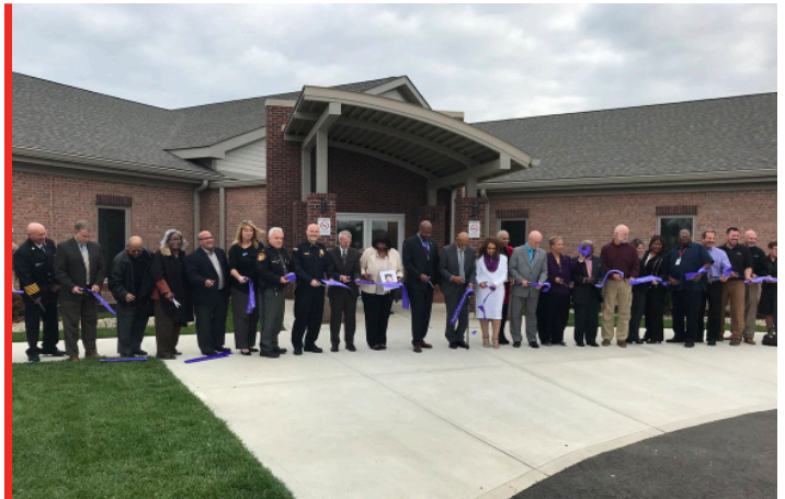
PROJECT C.U.R.E. RIBBON-CUTTING CEREMONY

On Thursday, November 2 nd , Project C.U.R.E., Inc. hosted a ribbon-cutting ceremony to celebrate the opening of its new location, in Moraine, Ohio.