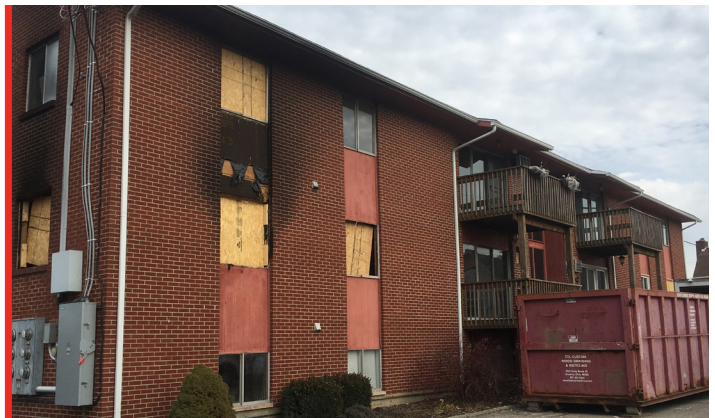
FRONT ELEVATION OF CENTERVILLE APARTMENT COMPLEX AFTER FIRE LOSS

The restoration scope is scheduled to include spray seal, new framing, flooring, paint, and drywall.