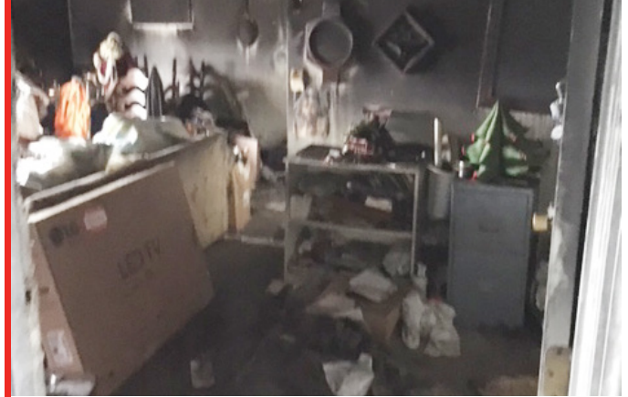
INTERIOR DAMAGE AT CENTERVILLE APARTMENT COMPLEX AFTER FIRE LOSS

Earlier this month, Greater Dayton Construction Group's Emergency Response Team (ERT) responded to a fire loss at a 12-unit apartment complex in Centerville, Ohio.