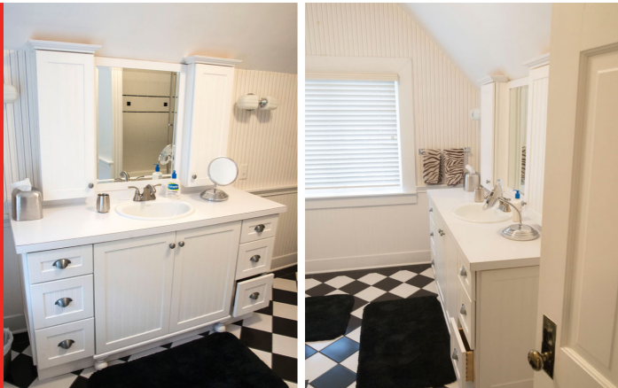
BEFORE PHOTOS OF GUEST BATHROOM AT THE SCHEAR RESIDENCE

The project scope is scheduled to include the installation of new showers, shiplap wood siding, tile flooring, cabinetry, doors, trim and paint.