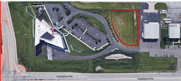
AERIAL PHOTO OF THE CONNOR GROUP HEAD-QUARTERS AND PROPOSED HANGAR LOCATION (OUTLINED IN RED)

The structure will also feature a 30'x100' biparting glass hangar door, ACM panel lighting, a High-X fire suppression foam system, a 12,000 gallon fuel dispenser tank, and two large air circulation fans.