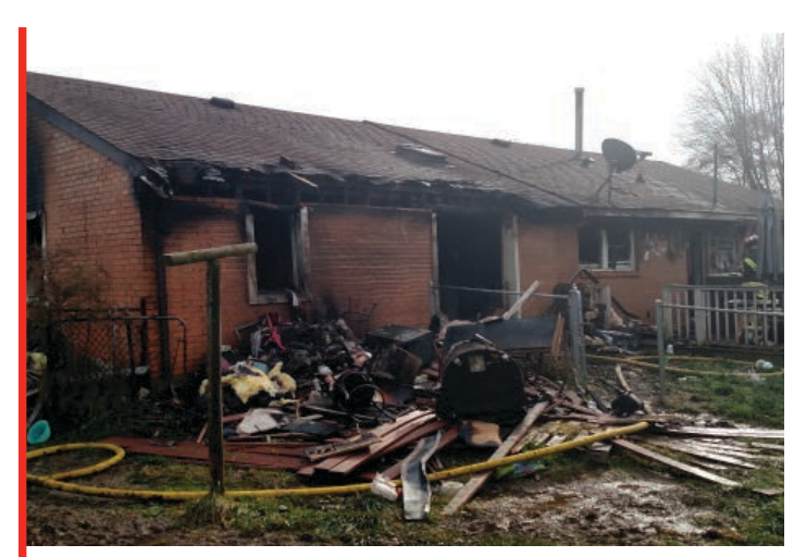
REAR ELEVATION OF WILLIAMS RESIDENCE AFTER FIRE LOSS

In November of 2016, Greater Dayton Construction Group's Emergency Response Team (ERT) responded to a house fire at the Williams Residence in New Carlisle, Ohio.