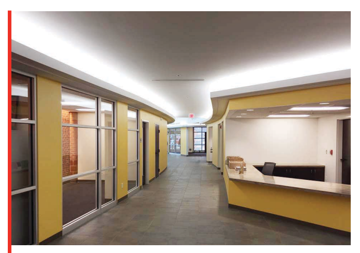
AFTER PHOTO OF LIBRARY SERVICE AREA

The renovation is highlighted by special architectural features including: new ceiling fans in the library wing and rotunda (located approx. 60+ feet above the floor), masonry columns, and "3-Form" illuminated exterior signage above the new entrances.