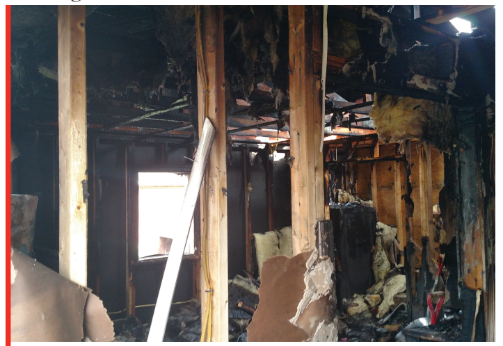
INTERIOR DAMAGE AT WILLIAMS RESIDENCE AFTER FIRE LOSS

After GDCG's Restoration Team further evaluated the property, the structure was ruled a total loss, and required full reconstruction efforts to meet current code regulations.