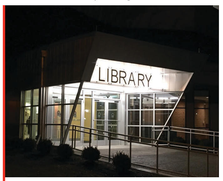
TRANSLUCENT CANOPY AT THE MAIN ENTRANCE

Exterior renovations included improved landscaping, new sidewalk and pavers, PVC Roof System, upgraded irrigation at new entrances, LED parking lot lighting, and a covered translucent canopy (leading to the new main entrance) — see photo below.