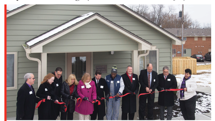
RIBBON-CUTTING / DEDICATION CEREMONY AT WHITMORE ARMS

The community contains a mix of two and threebedroom apartments located within six brick and vinyl sided buildings (for a total of 49,450 sqft.).