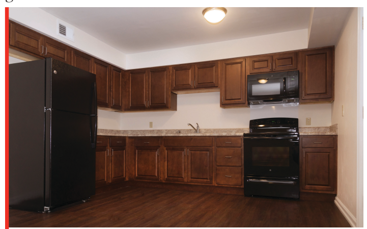
PHOTO OF RENOVATED KITCHEN AT WHITMORE ARMS

Awarded to OTC in April 2016, the renovation scope included: improved mechanical systems, bathroom and kitchen remodels, and Energy Star rated appliances. Interior renovations were highlighted by new painting and flooring, as well as LED lighting upgrades.