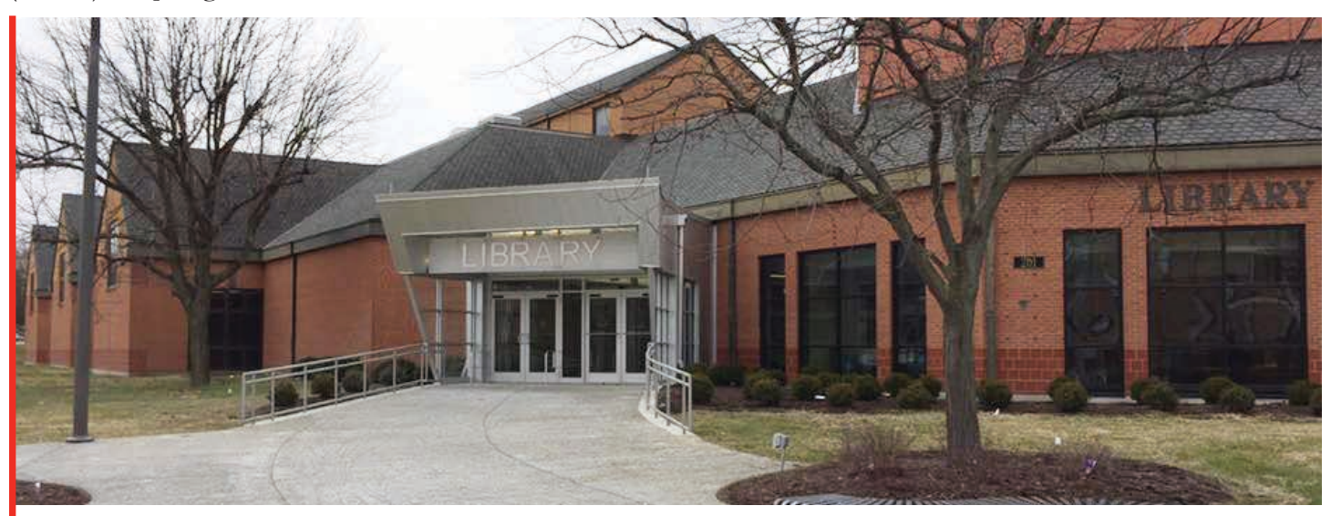
FRONT ELEVATION OF CLARK COUNTY PUBLIC LIBRARY LOCATED AT 201 S. FOUNTAIN AVE.

Earlier this month, OTC substantially completed construction / renovations at Clark County Public Library (CCPL) in Springfield, Ohio.