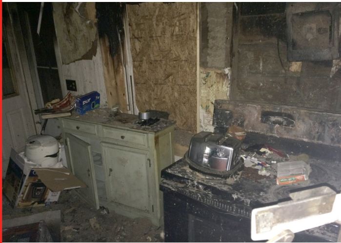
INTERIOR DAMAGE OF CURRENT RESIDENCE AFTER FIRE LOSS

In May of 2016, Greater Dayton Construction Group's Emergency Response Team (ERT) responded to a house fire at the Current Residence in Lewisburg, Ohio.