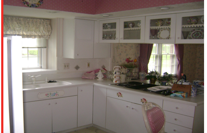
BEFORE PHOTO OF DeDARIO KITCHEN

GDB&R worked with the DeDario's to develop an "aging-in-place" design that would enhance both the functionality and aesthetic of their home.