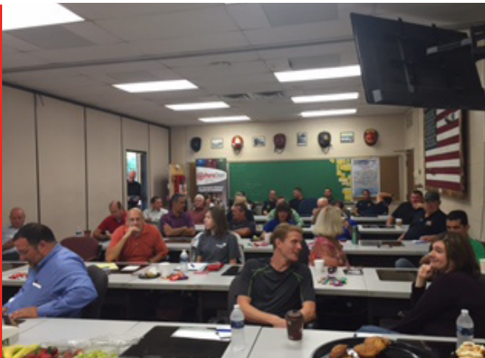
PHOTO OF LIVE BURN TRAINING ATTENDEES

The day included a live burning of two "Burn Cells", where participants had the opportunity to witness the flash of an electrical arc, watch as fire progression occurs and fire patterns emerge.