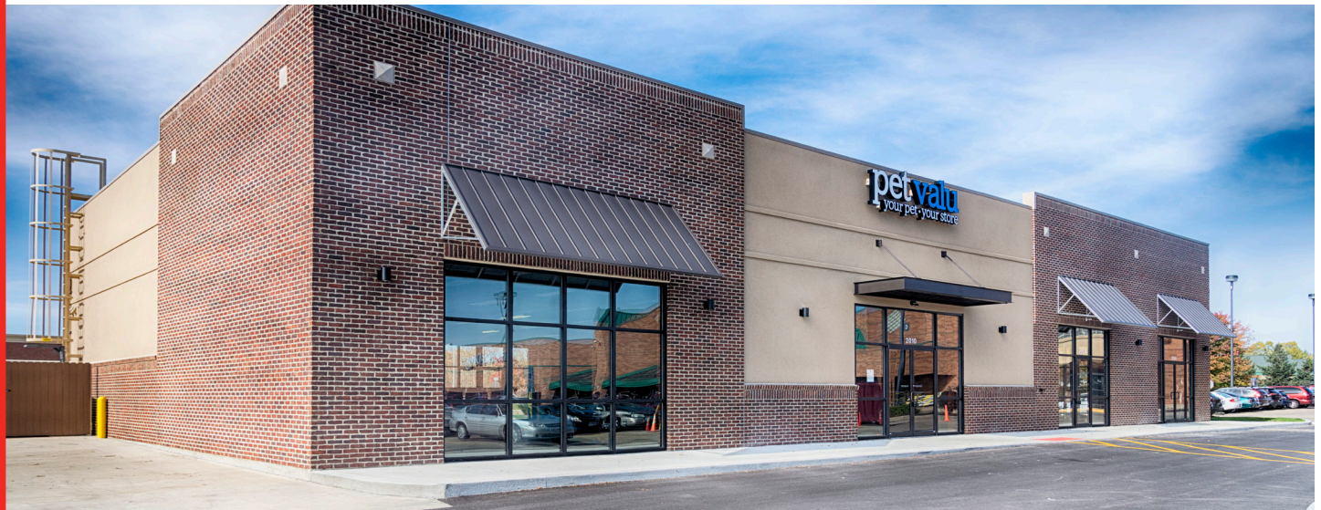
FRONT ELEVATION OF SHOPPES II LOCATED AT E. DAYTON YELLOW SPRINGS ROAD