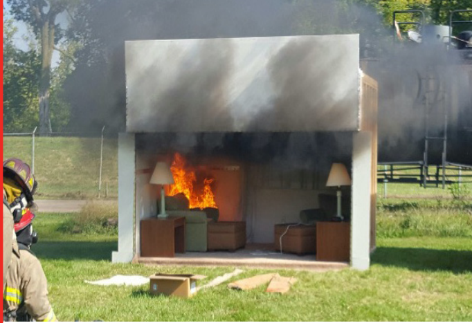
PHOTO OF LIVE BURN DEMONSTRATION

On Thursday, October 6th, members of GDCG's Insurance Restoration Division attended a "Live Burn" at the Dayton Fire Department Training Center.