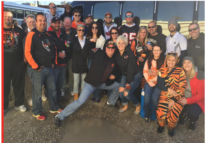
TAILGATERS POSE FOR A QUICK PHOTO BEFORE THE BENGALS GAME

The event featured beverages, cornhole, and – of course – good company. The Bengals were even able to pull out a victory (finally!) over the Cleveland Browns, with a score of 31-17.