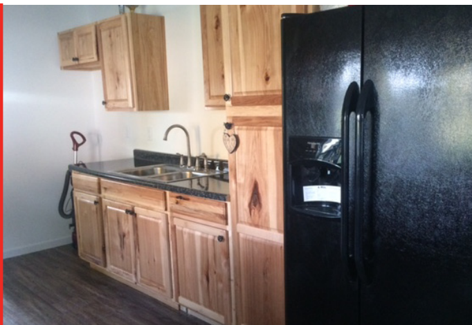
AFTER PHOTO OF RESTORED KITCHEN AT CURRENT RESIDENCE

In addition, the home received new flooring, drywall, and paint throughout the first floor.