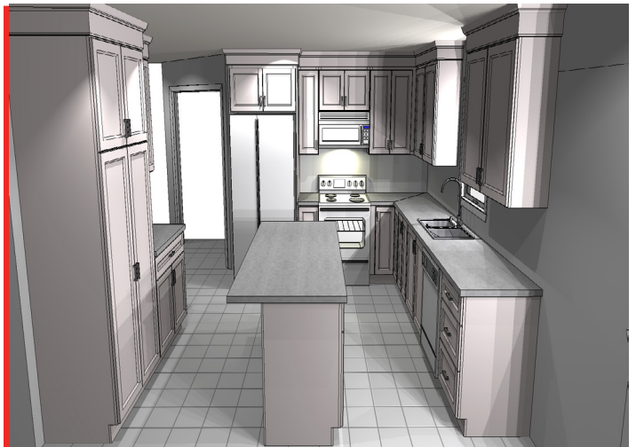
DESIGN RENDERING OF DeDARIO KITCHEN

Selections in the condo included: DuraSupreme cabinetry, LVT flooring, and Cambria Quartz countertops.