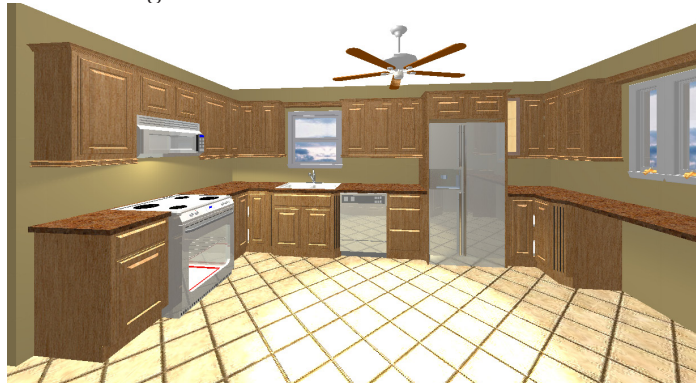
20/20 Copeland Kitchen Concept Rendering

Jill Copeland's existing kitchen lacked the form and function she desired. She came to Greater Dayton Building & Remodeling wanting a rejuvenated kitchen complete with additional cabinetry, granite countertops and a pass-through area to her living room. In addition to the new design, the installation of a new soffit, with recessed can lighting will be added to accent the granite bar below.