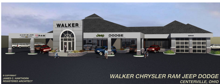
Conceptual Rendering of Walker Chrysler Dodge Jeep Ram

University of Dayton Student Housing | Located on the 400-block of Lowes Street, the new student housing development will be composed of two phases of construction. Phase one will include the build out of four new 2,500 sqft. student houses while the second phase is highlighted by a 45-spot parking lot. All homes will feature five-bedrooms and three-full baths, and be compliant with all Uniform Federal Accessible Standards (UFAS). In addition to being fully UFAS compliant, each house will be high efficiency and Energy Star rated. To accommodate new students for the 2012 academic year, the project is scheduled for completion in July.