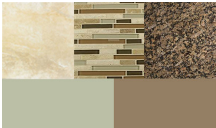
Copeland Remodeled Kitchen Selection Samples

Ms. Copeland selected a newer flooring product called Duraceramic. This tile has grown in popularity as it is warm under foot, has great stain resistance and is made of composite materials that are reminiscent of porcelain tile. The color palette for the project includes Sherwin Williams paint colors Sedate Gray and accent wall in Portebello. Amarillo Boreal granite countertops add depth while complementing the glass/stone backsplash. Stainless steel appliances will complete this sparkling new kitchen, scheduled for completion in late April.