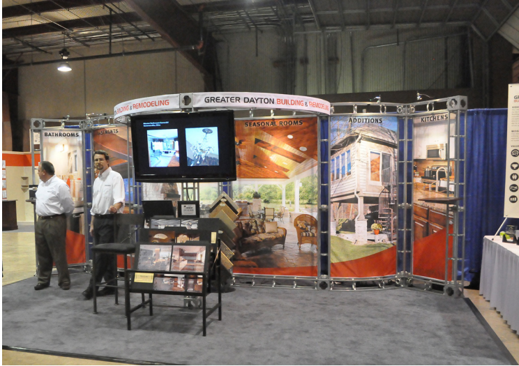
Miami Valley Home Improvement Show Truss Display

The annual Miami Valley Home Improvement Show was held earlier this month at Hara Arena. The four-day event was an opportunity to meet prospective customers and discuss possible remodeling opportunities.