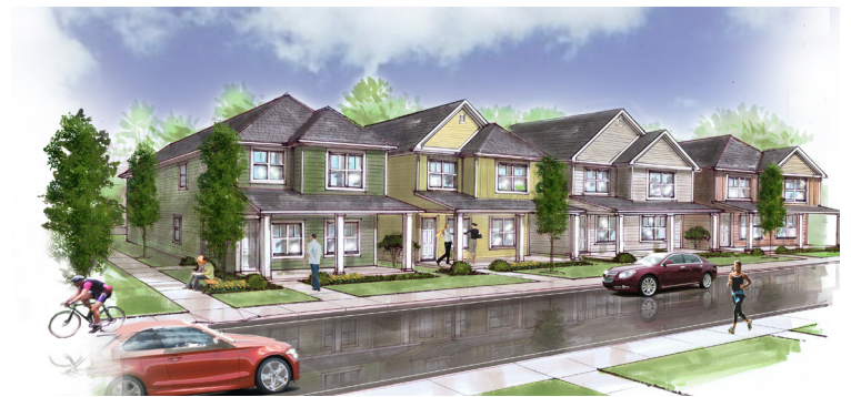
Conceptual Rendering of Lowes Street Student Housing -Courtesy of Visions by Grant

Dayton View II | Located at the intersection on N. Williams and Holt Street, Dayton View II is a single family project consisting of 32 new homes. Each home will be approximately 1,550 sqft. and Energy Star certified. Dayton View II will have three different home layouts. Of the 32 homes, four homes will be three-bedroom ranches, 26 will be four-bedroom two-stories, and two will be five-bedroom two-stories. The project is scheduled for completion in September of 2012.