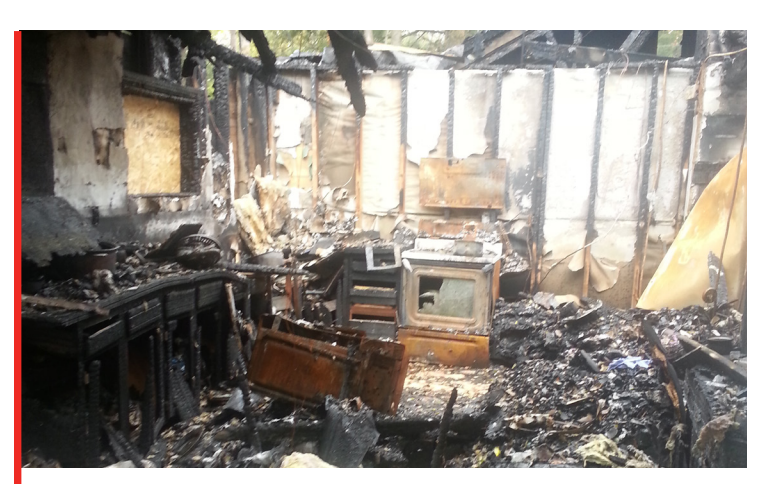
KITCHEN AT TYREE HOME AFTER FIRE LOSS

Upon initial inspection, the home was ruled a total loss and would need to be fully rebuilt to meet current code requirements. In addition to a full-home restoration, two land lots had to be replotted to accommodate the new structure and septic mound system.