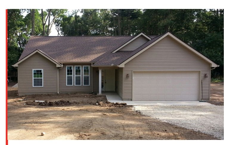
FRONT ELEVATION OF TYREE RESIDENCE AFTER RESTORATION EFFORTS

Date to Production: May 25, 2014 Completion Date: Sept. 30, 2014