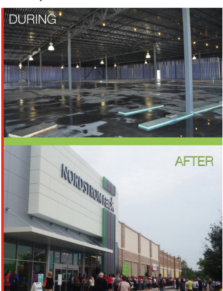
DURING AND AFTER PHOTOS OF NORDSTROM RACK

After announcing plans to expand in early 2014, The Greene (owned by Olshan Properties), contracted Oberer Thompson Company to build a 54,000 sqft. building shell, which is now home to the region's first Nordstrom Rack (35,000 sqft.). OTC began construction efforts in January and finished the project at the end of July.