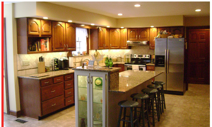
KITCHEN AT BERNARD RESIDENCE AFTER REMODELING EFFORTS

Selections in the kitchen included: Cambria Quartz countertops, tile backsplash, new sink and faucet as well as an added end cabinet in a contrasting color.