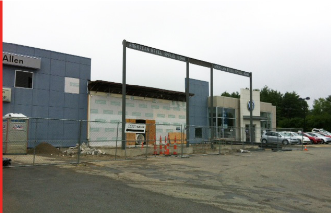
STEEL FRAMING OF THE AUDI ADDITION (IN PROGRESS) AT WHITE ALLEN EUROPEAN AUTO DEALERSHIP

In early June, the White Allen European Auto Dealership located in Miamisburg, Ohio, underwent a series of building improvements as part of their franchise's (Porsche and Audi) new corporate brand requirements.