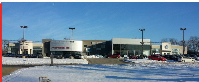
FRONT ELEVATION OF WHITE ALLEN EUROPEAN AUTO DEALERSHIP AFTER RENOVATIONS

Oberer Thompson Company was awarded the contract in June of 2013 and finalized construction in January 2014.