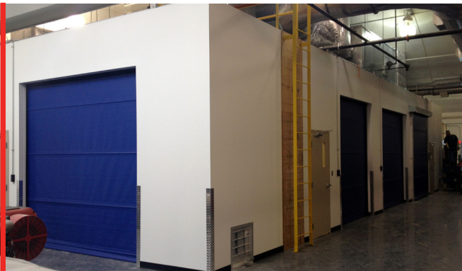
LAB ENCLOSURE AT UNIVERSITY OF DAYTON RESEARCH INSTITUTE

The new laboratory will be used to produce carbon nanotubes continuously on a wide-range of substrates, including carbon fabric and fiberglass.