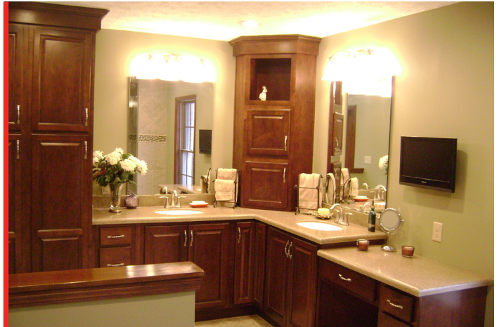
MASTER BATHROOM AT BERNARD RESIDENCE

Under the remodeling contract, GDB&R provided a new floorplan in the master bathroom, complete with a full tile shower, new vanity cabinets and flooring.