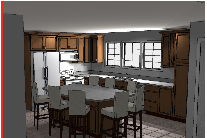
PROPOSED RENDERING OF NEW KITCHEN AT REYNOLDS RESIDENCE

The repair scope is scheduled to include a new kitchen floorplan, bathroom restoration, as well as new flooring and paint throughout the home.