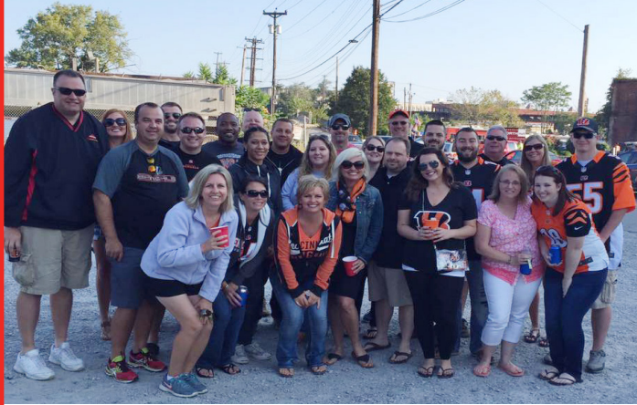
TAILGATERS POSE FOR A QUICK PHOTO BEFORE THE BENGALS GAME

On Sunday, September 25, GDCG, along with trade partner AllServ, traveled with agents and adjusters to Paul Brown Stadium to cheer on the Bengals during the team's season home-opener.