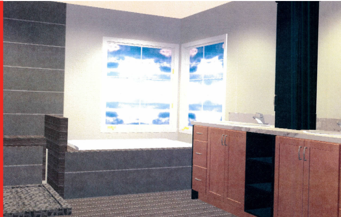
PRELIMINARY RENDERING OF WYSONG MASTER BATHROOM -RENDERING COURTESY OF VICTOR ROONEY

Greater Dayton Building & Remodeling recently completed a master bathroom renovation at the Wysong Residence in Beavercreek, OH.