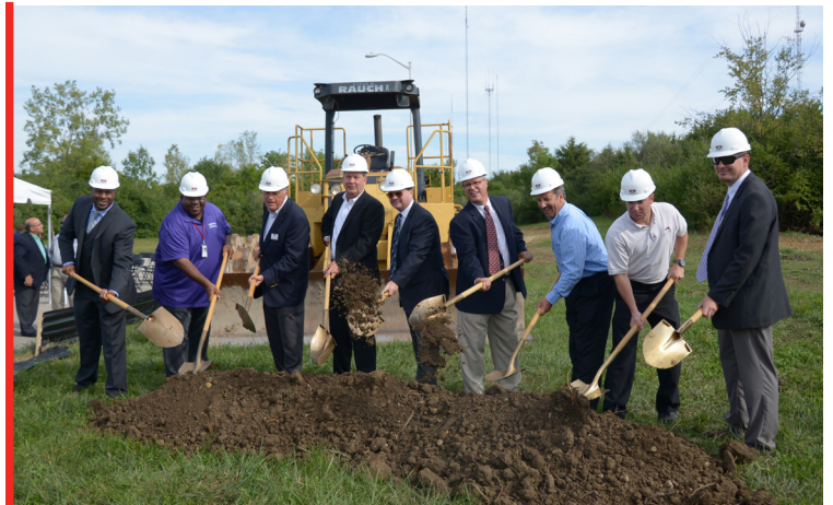
PHOTO OF CONSTRUCTION TEAM AT PROJECT CURE GROUND BREAKING

In an effort to increase accessibility for its patients, and accommodate the need for additional space, the new building (located on Daruma Parkway in Moraine) will feature administrative offices, client service areas,