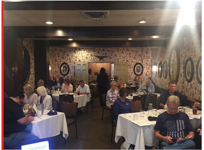
INSURANCE PROFESSIONALS ATTEND CONTINUING EDUCATION COURSE AT THE GOLDEN LAMB

The courses were hosted at The Golden Lamb in Lebanon, Ohio and focused on Deodorization and Water Damaged Wood Floors.