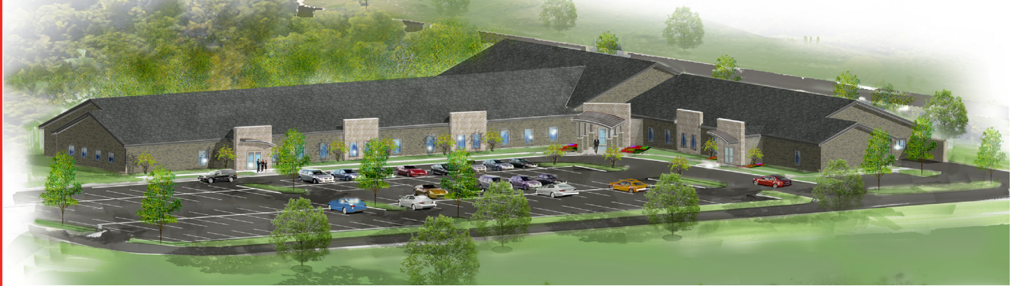
CONCEPTUAL RENDERING OF PROJECT CURE'S NEW MORAINÉ LOCATION

—RENDERING COURTESY OF MATRIX ARCHITECTS