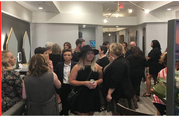
PHOTO OF GRAND OPEN HOUSE CELEBRATION AT SQUARE ONE SALON-OAK CREEK

On Friday, September 16, Square One Salon hosted a Grand Open House to celebrate the opening of its newest Centerville location (tenant build-out completed by GDCG in March).