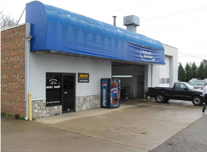
Existing Body Shop at Jeff Schmitt Nissan in Beavercreek, Ohio.

The new showroom will be approximately 2,300 sqft. and will be an addition to the existing body shop.