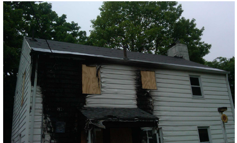
Damaged Rear Elevation of Sakoman Residence

In late April, Keli and Alan Sakoman of Kettering suffered extensive fire damage to their home when the rear patio of the caught fire. GDCG's Emergency Response Team responded to the call and boarded up the residence until further restoration efforts could begin.