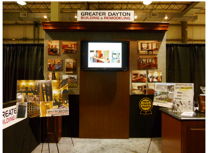
GDB&R Display Booth at the Dayton Women's Fair

For the Remodeling Division, the weekend of September 15 th and 16 th was a busy one! Greater Dayton Building & Remodeling participated in the 2 nd annual Dayton Women's Fair, hosted by Cox Media Group at the Airport Expo Center.