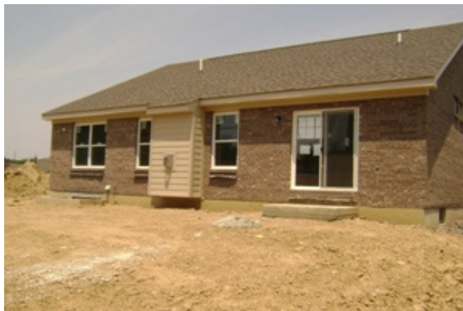
Existing Rear Elevation of Kirkwood Residence

The new outdoor living space will be approximately 400 sqft. and will provide much needed seating space for outdoor get togethers.