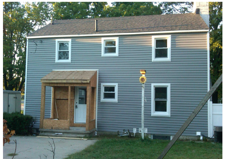
Rear Elevation after Siding Replacement of Sakoman Residence (Porch in Progress)

What initially started as an exterior fire, quickly spread to the ceiling rafters, kitchen, mud room, and to two second floor bedrooms. The restoration scope includes: door, kitchen, window, flooring, roof and siding replacement as well as smoke and water mitigation.