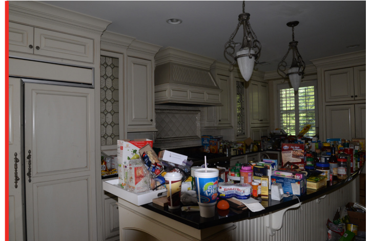
SMOKE-DAMAGED KITCHEN IN OAKWOOD HOME

Earlier this month, GDCG's Insurance Division began restoration efforts on a +/- 10,000 sqft. home in Oakwood.