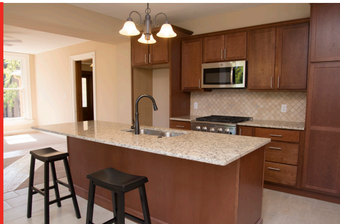
AFTER PHOTO OF RENOVATED KITCHEN IN KRATOCHWILL HOUSE

During the event, the Sixth Street Lofts and the Kratochwill House (301 E. Sixth Street) were open to the public for tours.