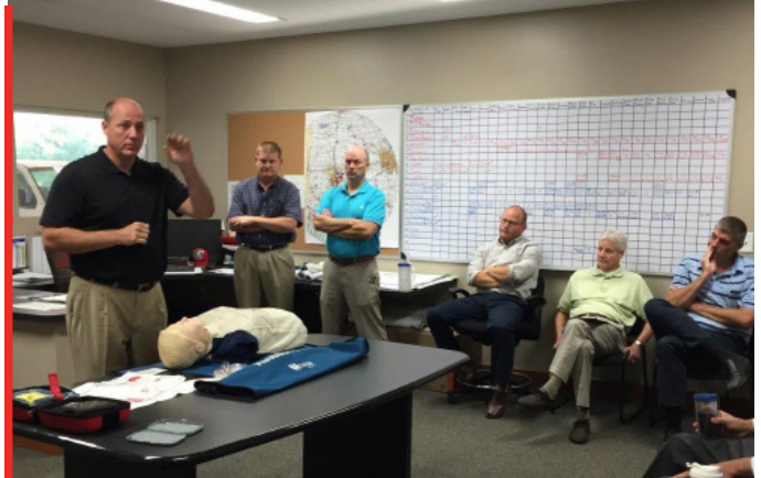
HEART DEFIBRILLATOR TRAINING AT GDCG

The defibrillator is located at the front of the office (by the front desk) and is available for immediate use — should the need arise.