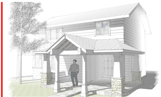
RENDERING OF GREATHOUSE RESIDENCE SHOWING PROPOSED PORCH RENOVATION - RENDERING COURTESY OF MATT JONES

Due to concerns about the existing concrete pad, GDB&R's Design Team and Sales Representative, Matt Jones, worked to design a functional — and structurally sound — porch renovation. To date, plans are in review stage with Oakwood zoning and production is scheduled to begin in late October.