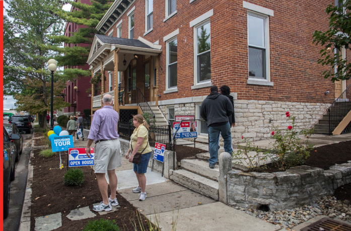
TOUR ATTENDEES STOP BY KRATOCHWILL TO TOUR THE RENOVATED SPACE

On Saturday, September 19th, GDCG featured two of its downtown residential developments in a housing tour hosted by the Downtown Dayton Partnership (DDP).