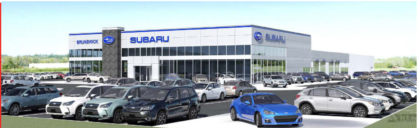
RENDERING OF PROPOSED BRUNSWICK SUBARU AUTO DEALERSHIP

Oberer Thompson Company was recently awarded the construction contract for a new Subaru dealership in Brunswick, Ohio. The project was awarded to OTC in July 2015 as a part of its expanding Northern Ohio project portfolio.