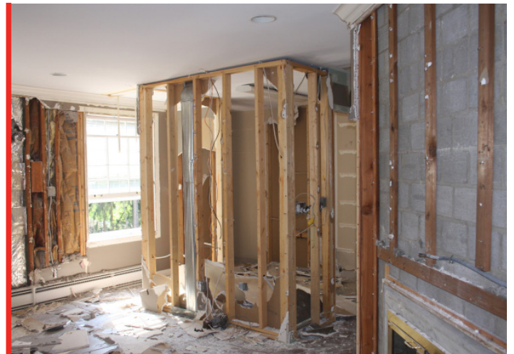
PROGRESS PHOTO OF DEMOLITION IN MASTER BEDROOM AT OAKWOOD HOME

What originally started as a fire in the garage, quickly spread through the house, causing extensive damage to the interior and exterior of the home.