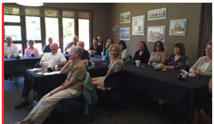
INSURANCE INDUSTRY PROFESSIONALS POSE FOR A QUICK PHOTO DURING THE CE COURSE

The course, “Residential Real Property Evaluation,” was hosted at GDCG’s main office and had 18 attendees.