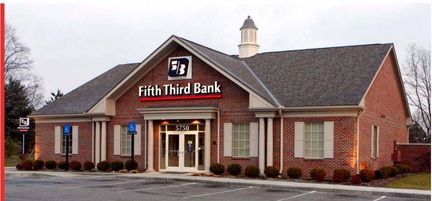
FIFTH THIRD DAYTON BRANCH COMPLETED BY OTC IN 2007 - PHOTO COURTESY OF VISUAL EDGE IMAGING