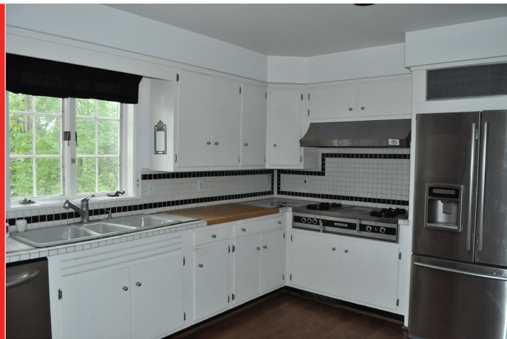
EXISTING KITCHEN IN COMACHO RESIDENCE

Greater Dayton Building & Remodeling is moving full speed ahead towards the completion of a whole-home renovation located at 451 Schenck Ave. in Oakwood.