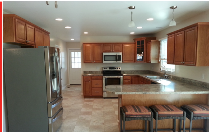
CURTIS KITCHEN AFTER RESTORATION PROJECT

As a result of the restoration, the home received several changes to its existing layout. These changes included: enlarged master suite created from a fourth bedroom (the home now has three), a walk-in shower in the master bath, and a new glass sliding door to the back patio — that now has a new awning.