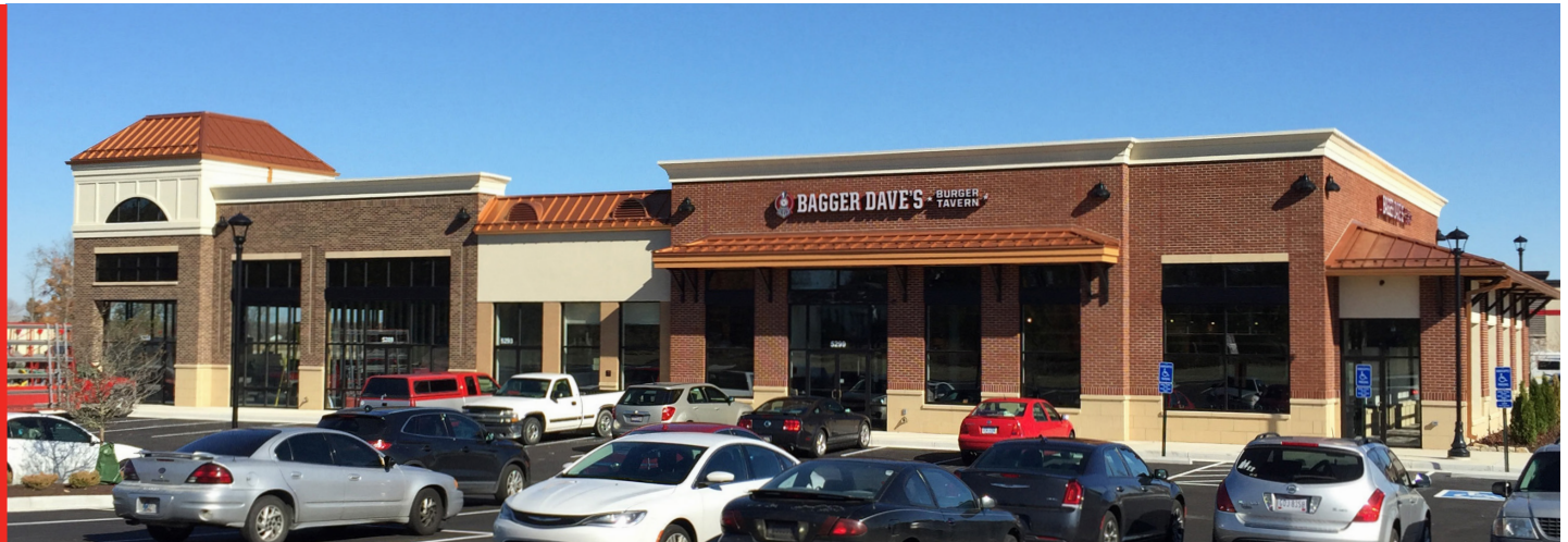
FRONT ELEVATION OF SHOPPES I AT CORNERSTONE DEVELOPMENT IN CENTERVILLE