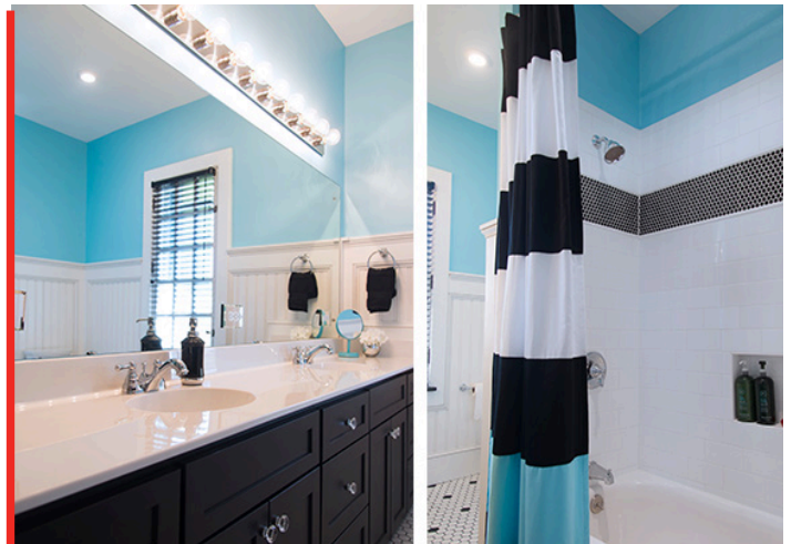
HALL BATHROOM RENOVATION AT DEUTSCH RESIDENCE

The Deutsch's second floor now features: a renovated hall bathroom (pictured below), a reconfigured master bathroom & closet, and new office space.