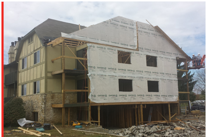
PROGRESS PHOTO OF WEST FACADE RECONSTRUCTION

As only the eastern half of the building is scheduled to remain, GDCG will modify the existing structure so that the fire wall that once separated the two halves will now serve as the western exterior elevation (photo below).