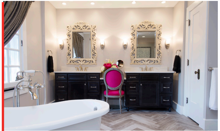
AFTER PHOTO OF MASTER BATHROOM