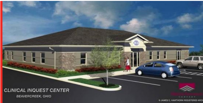
PROPOSED RENDERING OF CIC'S NEW MEDICAL BUILDING IN BEAVERCREEK

Earlier this month, Oberer Thompson Company hosted a ground-breaking ceremony to celebrate the commencement of construction at Clinical Inquest Center's new medical space in Beavercreek.