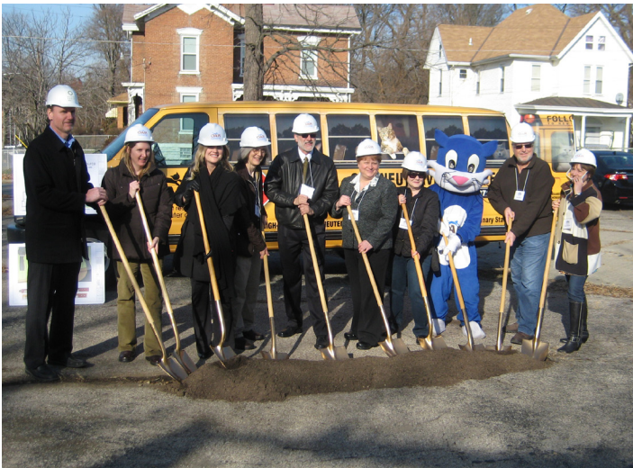
Ground Breaking Ceremony for Ohio Alleycat Resource Center

The non-profit organization, Ohio Alleycat Resource (OAR), held a ground breaking ceremony on November 29 th to celebrate the expansion of its Clinic and Adoption facility, located in Cincinnati, Ohio. The new state-of-the-art facility will be approximately 4,686 sqft. and will house six adoption rooms, two special needs rooms, a veterinary office, exam room, and other office spaces.