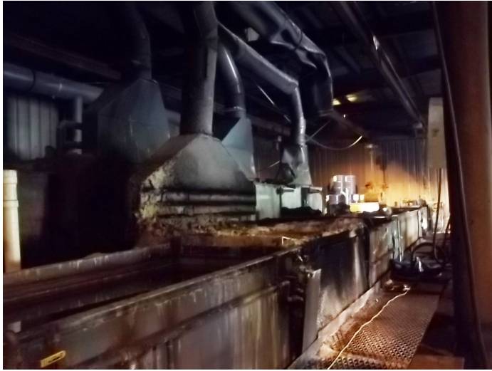
Before Photo of Acid Tank, Rinse Tank and Black Oxide Tank Which Caught Fire at Quality Steel Corporation

Greater Dayton Construction Group's restoration team has worked diligently to return Quality Steel Corporation, located in Moraine, back to new after it suffered an extensive fire loss in August, 2012.