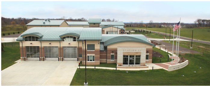
Miami Township Fire Station Facility Front Elevation

Oberer Thompson seized the opportunity to utilize the company to photograph the Miami Township's Fire Station and Public Works Facility. The project, which covers approximately 25 acres in land, was photographed using a remote control helicopter and Cannon Mark II camera.