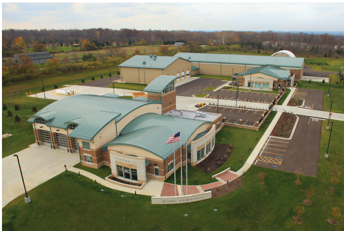
Aerial Photo Taken at Miami Township Fire Station and Public Works Facility

If you have a project that would photograph especially well aerially, or if you are interested in on-site videography, contact Perfect Perspectives at www.perfectperspectivesaerial.com for a quote or see External Communications Coordinator, Caroline Morgan.