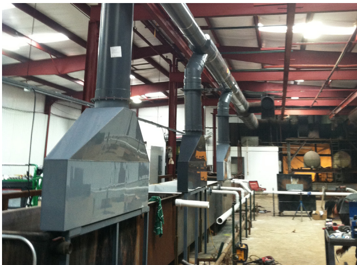
In Process Photo of Acid Tank, Rinse Tank and Black Oxide Tank repairs

The project, which was completed earlier this month, had a restoration scope that included: replacing damaged insulated ceilings, all ventilation, exhaust and duct work, replacement of three chemical tanks and liners as well as soda blasting to all steel framework in the 7,000 square foot structure.