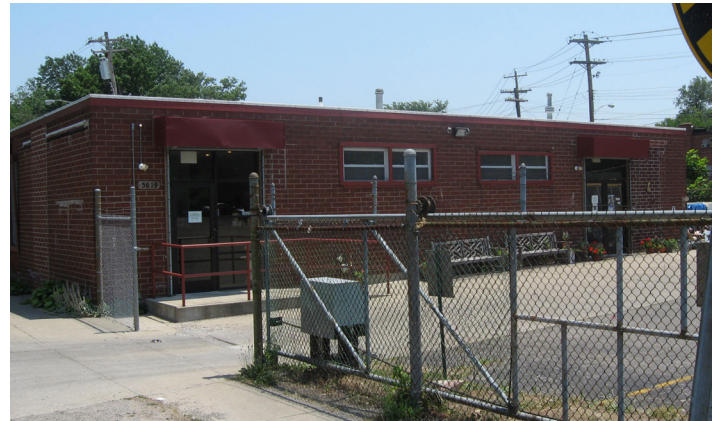
Current OAR Building Located in Cincinnati, Ohio

The existing OAR building is approximately 5,000 sqft., located across the parking lot, and will continue to be used as clinical space during construction.