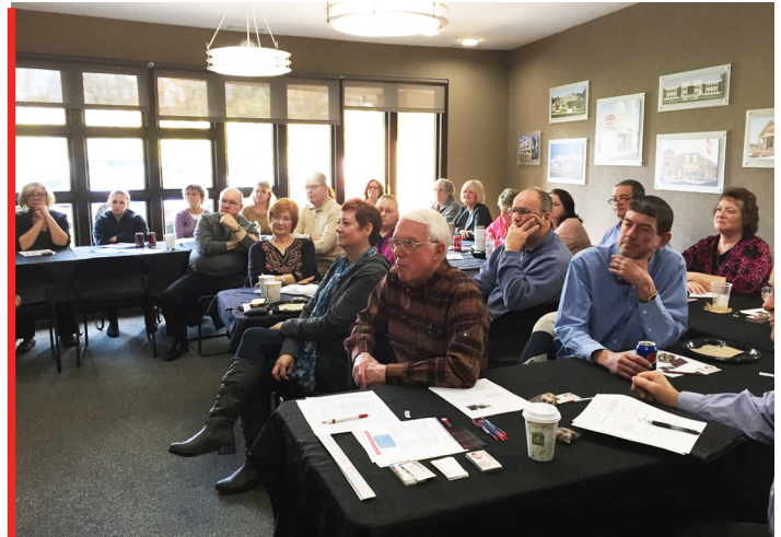
CE COURSE ATTENDEES LISTEN IN ON THE LECTURE

The courses were hosted at the GDCG main office and focused on fire mitigation.