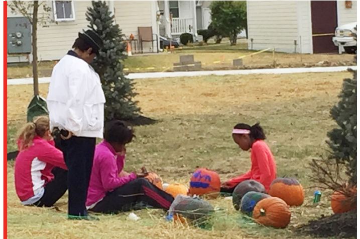
CHILDREN ENJOYING PUMPKIN PAINTING AT THE FALL FESTIVAL

Activities at the festival included a cook out, pumpkin painting and games of cornhole!