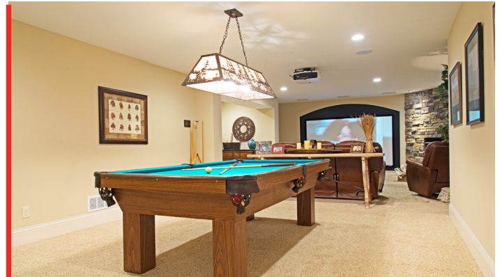
AFTER PHOTO OF BILLIARDS AREA IN BECK BASEMENT

After the structural issues were repaired, GDB&R’s production team went to work on the basement renovation scope.