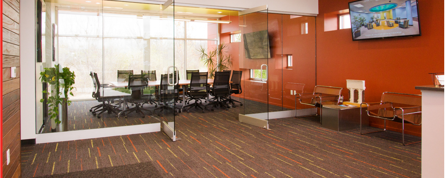
MAIN CONFERENCE ROOM AT LEVIN PORTER ASSOCIATES' NEW MAIN OFFICE IN MIAMI TOWNSHIP