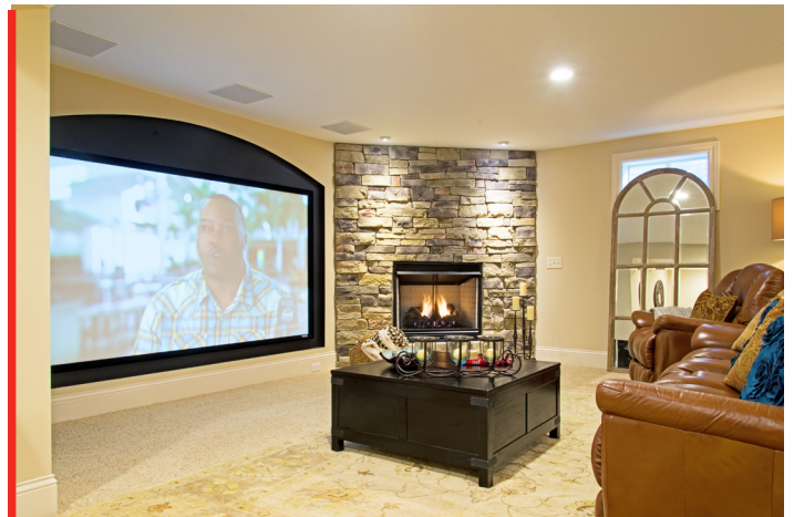
AFTER PHOTO OF ENTERTAINMENT AREA AND FIREPLACE IN BECK BASEMENT

The project included the addition of a media area, gas fireplace with stone surround, and a wet bar with granite countertop and stone backsplash.