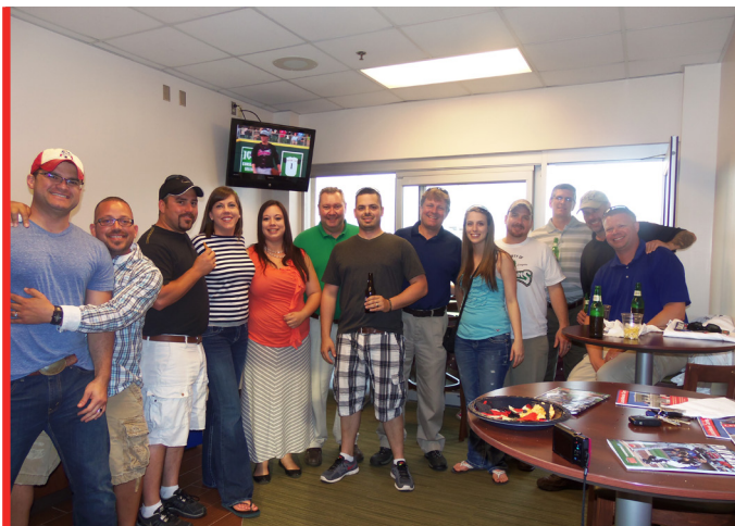
GDCG EMPLOYEES ENJOY A DRAGONS BASEBALL GAME

On Tuesday, May 20, members of GDCG attended an evening out at a Dayton Dragons baseball game in appreciation of their hard work and commitment to the organization. While the Dragons weren’t able to pull out a win against the Great Lakes Loons, a good time was still had by all! Thank you to those who helped contribute to the evening’s success!