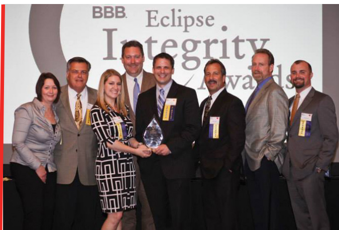
GDC, LTD. TEAM MEMBERS POSE FOR A PHOTO WITH THE ECLIPSE INTEGRITY AWARD FOLLOWING THE CEREMONY

The event honored a total of six organizations with the prestigious award in front of a crowd of nearly 500 attendees at Sinclair's David H. Ponitz Center. Five local high school students also received the Students of Integrity Award at the event, while the Community Honor award was presented to Sinclair Community College and the fifth annual Torch Award was awarded to the Tera-data Corporation.