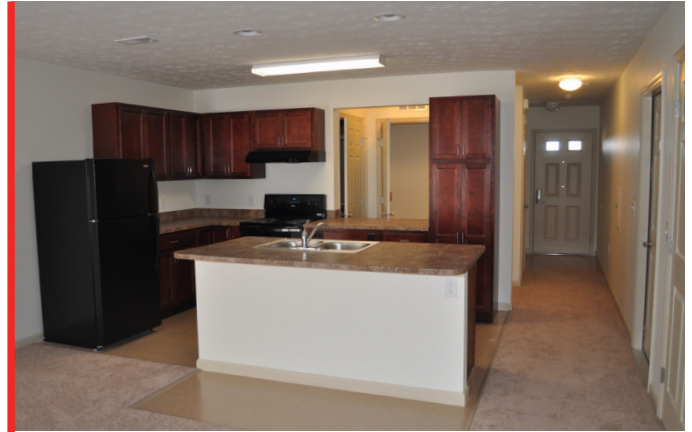
KITCHEN IN A HOOVER COTTAGE UNIT

Oberer Thompson Company recently completed construction efforts on the first phase of Hoover Cottages for St. Mary’s Development Corporation.