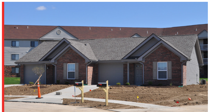
FRONT ELEVATION OF HOOVER COTTAGES PHASE I (PRIOR TO LANDSCAPING EFFORTS)

The first of the multi-phase project consists of five ADA accessible duplexes (10 units) that are approximately 928 sqft. in size and feature: two bedrooms, one and a half bathrooms, high-efficiency appliances, screened-in back porches, and heated garages.