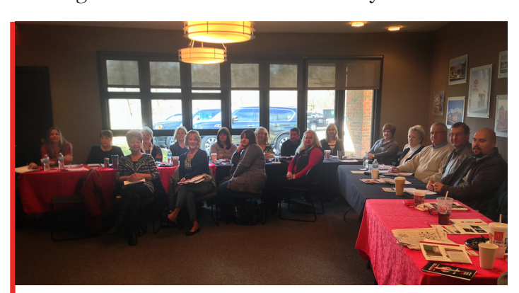
CE ATTENDEES POSE FOR A QUICK PHOTO DURING EFFECTIVE CLAIM MANAGEMENT DISCUSSION

During the month of March, Greater Dayton Construction Group, along with trade partner PuroClean Dayton, hosted continuing education courses for those working in the home insurance industry.