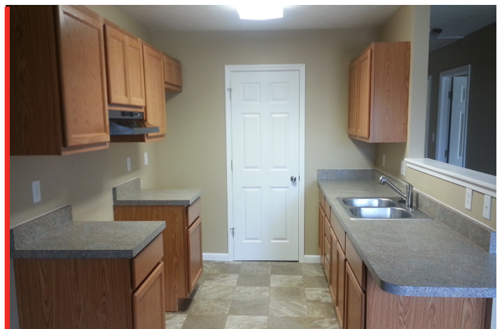
PHOTO OF KITCHEN AFTER RESTORATION EFFORTS - PHOTO COURTESY OF DAVE SISSON

The project scope included the installation of new mechanical systems, insulation, flooring, cabinetry, and doors. Exterior repairs included a new roof, siding, and windows.