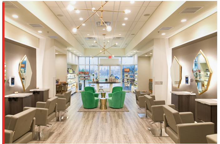
PHOTO OF ENTRY / STYLING STATIONS AT SQUARE ONE SALON OAK CREEK

Greater Dayton Construction, Ltd. recently completed a tenant improvement project for the Dayton area's newest Square One Salon location at the Oak Creek Market Place in Washington Township.