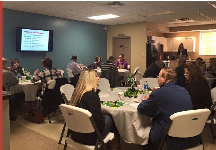
INSURANCE PROFESSIONALS ATTEND CONTINUING EDUCATION COURSE AT ALLSERV

On March 8th, GDCG — along with trade partner AllServ— hosted a continuing education course for those working in the home insurance industry.