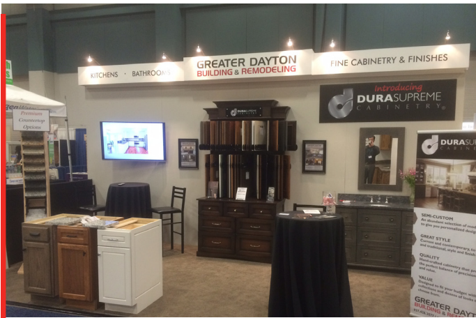
PHOTO OF BUILDING AND REMODELING BOOTH AT DAYTON HOME AND GARDEN SHOW

Exhibitors at the event showcased the latest in home improvement, outdoor living, kitchen and bath design, and culinary demonstrations. The three-day show was an opportunity for GDB&R to meet prospective customers and discuss possible remodeling opportunities.