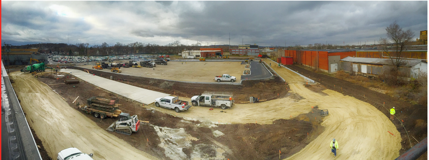
PROGRESS PHOTO OF NEW PARKING LOT AND BUS TURNAROUND (JANUARY 2016)