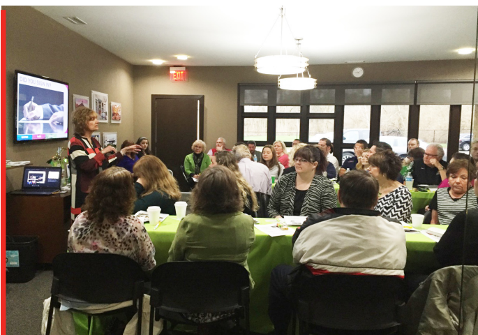
INSURANCE PROFESSIONALS ATTEND CONTINUING EDUCATION COURSE AT GDCG

Attendees from both days donated items to Blue Star Mothers – a non-profit organization that supports mothers who have children serving in the U.S. Armed Forces.