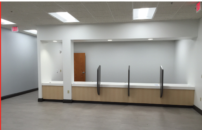
PHOTO OF PHASE I RECEPTION AREA AT MONTGOMERY COUNTY JOB CENTER