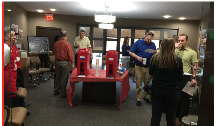
GDCG EMPLOYEES GATHERED FOR COFFEE COURTESY OF THE DAYTON-AREA RED CROSS

Special thanks to the Red Cross for the kind gesture and for its on-going support of the Dayton Community!