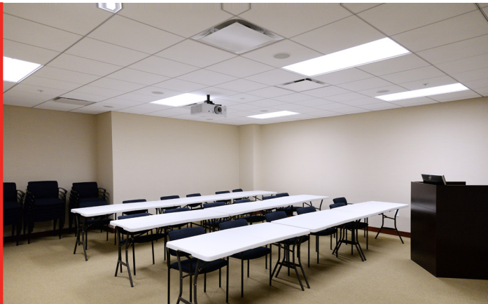
RENOVATED SEMINAR ROOM AT MORGAN STANLEY

Finishes in the space included: new doors, trim work, frosted glass panels, and energy-efficient lighting. In addition to the expansion, OTC also renovated a seminar room in the existing space.