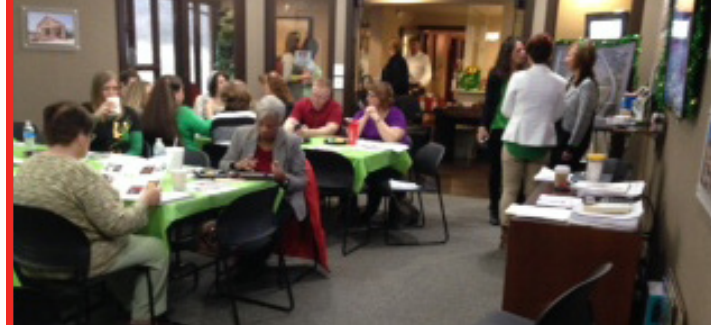
INSURANCE PROFESSIONALS ATTEND CONTINUING EDUCATION COURSE

During the month of March, Greater Dayton Construction Group, along with trade partner PuroClean Dayton, hosted continuing education courses for those working in the home insurance industry.