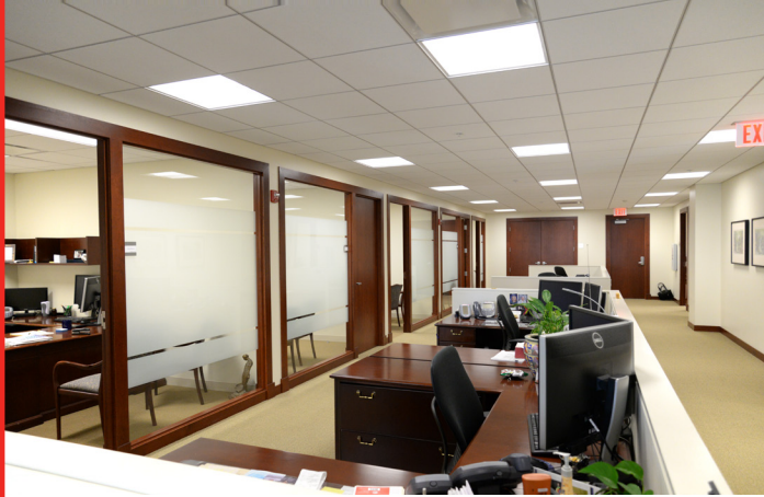
MORGAN STANLEY OFFICE EXPANSION AT THE GREENE

The project's expansion scope included the build-out of 10 offices, a conference room, break room and copy area — totaling +/- 2,700 sqft.