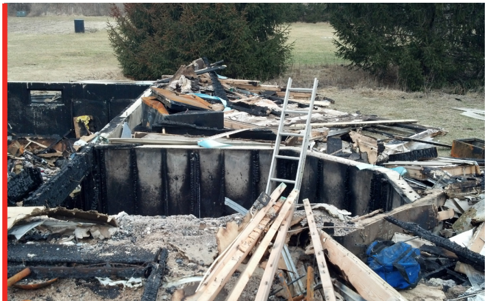
TUDOR RESIDENCE AFTER FIRE DAMAGES

Upon initial inspection, the structure was ruled a total loss, needing full reconstruction efforts to meet current code requirements.