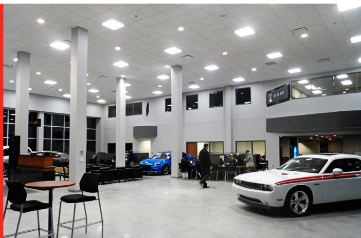
INTERIOR OF NEW SHOWROOM AT NORTH OLMSTED CHRYSLER DODGE JEEP RAM

To date, OTC has redeveloped the existing site and substantially completed construction on the new two-story showroom / service reception building (+/- 18,600 sqft.).