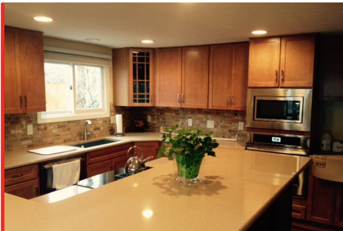
THE MACKE’S NEWLY RENOVATED KITCHEN

After weighing their options, the Macke’s decided to move forward with the renovation and a new contract, including the structural repairs, was prepared.