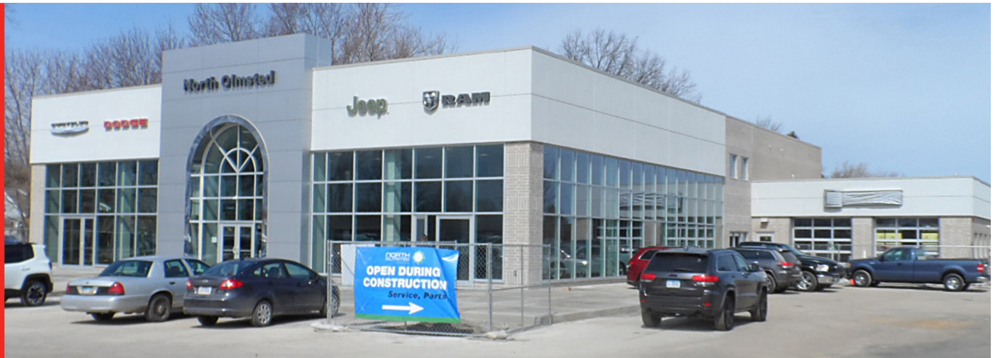
FRONT ELEVATION OF NEW SHOWROOM AT NORTH OLMSTED CHRSYLER DODGE JEEP RAM AUTO DEALERSHIP

Oberer Thompson Company has reached a project milestone on the multi-phase North Olmsted Chrysler Dodge Jeep Ram Auto Dealership. The project was awarded to OTC in July 2014, adding to its expanding Northern Ohio project portfolio.