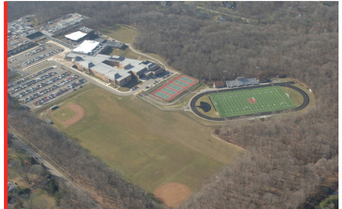
AERIAL PHOTO (BEFORE RENOVATIONS) OF INDIAN VILLAGE ATHLETIC COMPLEX

The renovation scope for this project is scheduled to include: demolition of existing ballfields, construction of one baseball and one softball field with synthetic turf infield, irrigated outfield, masonry dugouts & backstops, and scoreboards.