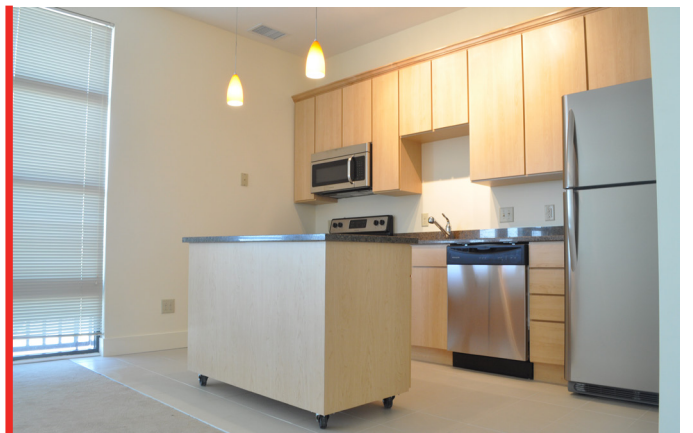
AFTER PHOTO OF APARTMENT UNIT AT THE GREENE

GDCG provided restoration services after a burst sprinkler head resulted in damage to three different units within the complex. The renovation scope included: new ductwork, drywall, paint, cabinetry, countertops and appliances.