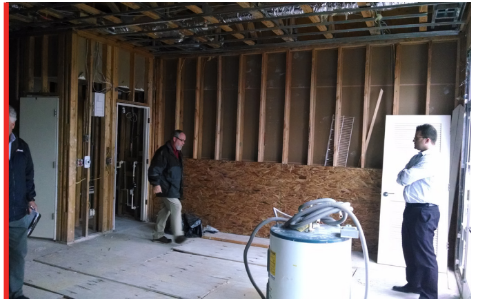
APARTMENT UNIT AT THE GREENE AFTER DEMOLITION EFFORTS

Greater Dayton Construction Group has finalized renovation efforts that began in April on a set of apartment units that suffered extensive water damage at The Greene Shopping Center.