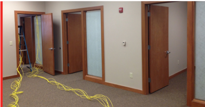
IN PROGRESS PHOTO OF NEW OFFICE SPACES AT NORTHWESTERN MUTUAL

The project's scope included the build out of seven offices, nine intern work areas, and a hallway to connect the existing offices to the expansion. OTC also provided construction services for a new beverage bar and corner desk in the existing Northwestern Mutual space.