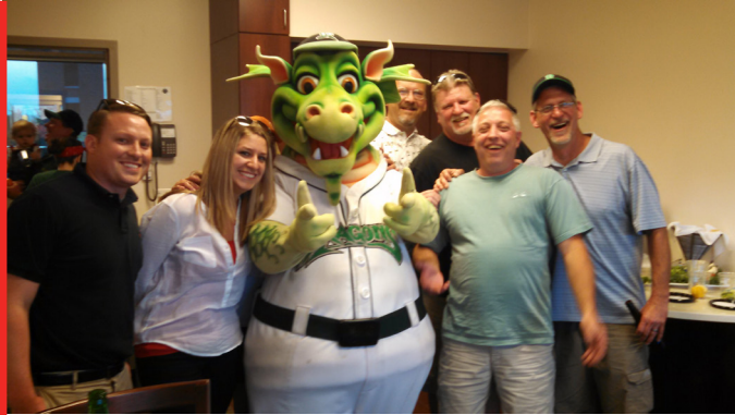
GDB&R EMPLOYEES POSE WITH HEATER FOR A QUICK PHOTO

In addition to enjoying good food and beverages, the employees celebrated a Dragons win over the Bowling Green Hot Rods! Thank you to those who helped contribute to the evening's success.