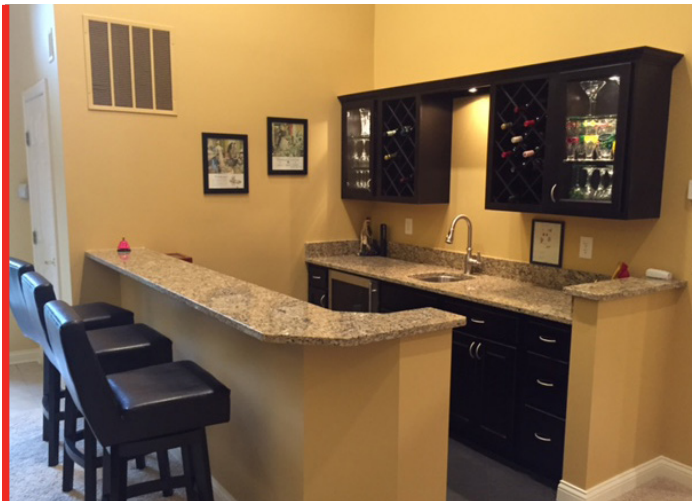
AFTER PHOTO OF BAR RENOVATION AT BOSE RESIDENCE

Selections included granite countertops, brushed nickel fixtures, and Merillat Cabinetry in a Java finish.