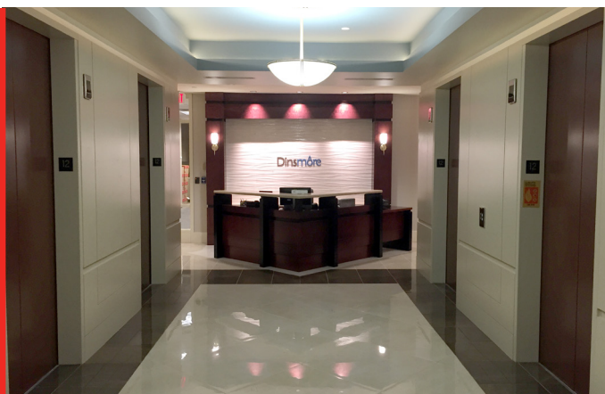
AFTER PHOTO OF LOBBY AT DINSMORE & SHOHL - PHOTO COURTESY OF GENO TARTELL