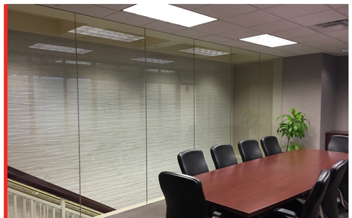
AFTER PHOTO OF A NEW CONFERENCE ROOM AT DINSMORE & SHOHL'S DOWNTOWN DAYTON OFFICE