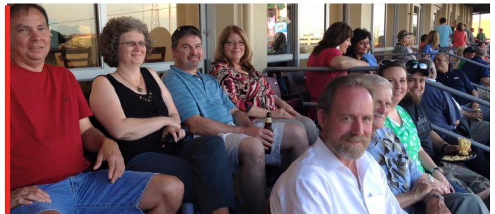
GAME ATTENDEES POSE FOR A QUICK PHOTO DURING THE BALL GAME

On Monday, June 15, Greater Dayton Construction Group hosted an evening out at the ballpark for those in the home insurance industry.