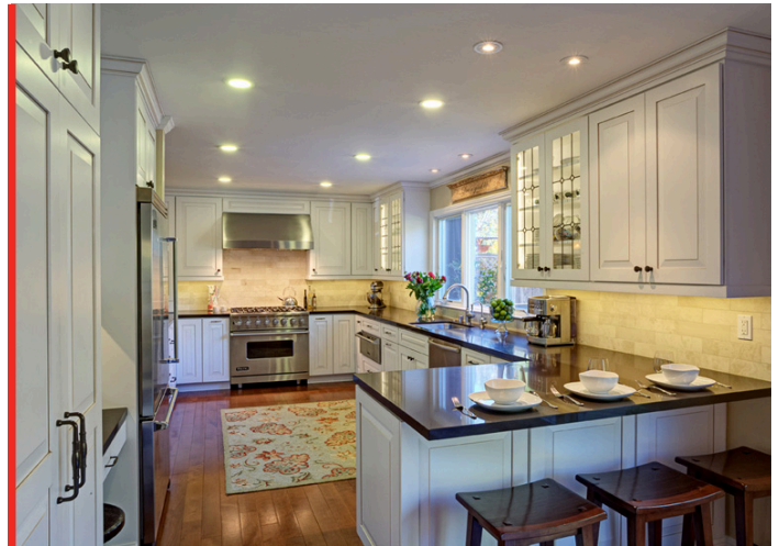
DURA SUPREME'S "CRESTWOOD" CABINETY WITH THE LANCASTER DOOR STYLE WITH A WHITE PAINT AND SIENNA ACCENT FINISH.

For 50+ years homeowners and designers have looked to Dura Supreme for kitchen and bath cabinetry that fulfills their desire for personalized design choices and outstanding quality of construction.