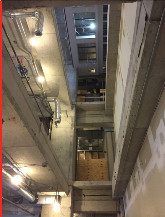
PROGRESS PHOTO OF SLAB DEMOLITION FOR STAIRCASE AT DINSMORE & SHOHL

After announcing plans to consolidate its downtown spaces in 2014, Dinsmore & Shohl LLP contracted with Oberer Thompson Company earlier this year to begin renovation efforts.