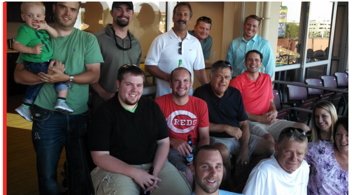
OTC EMPLOYEES POSE FOR A QUICK PHOTO WHILE ENJOYING THE GAME

Thank you to those who helped contribute to the evening's success.