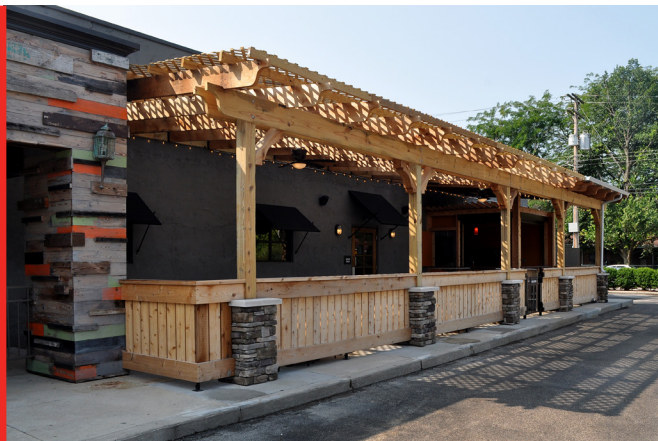
WHEAT PENNY BAR & OVEN AFTER PATIO ADDITION

The patio also features a lattice roof, handicap accessible countertop, and a concrete bar top.