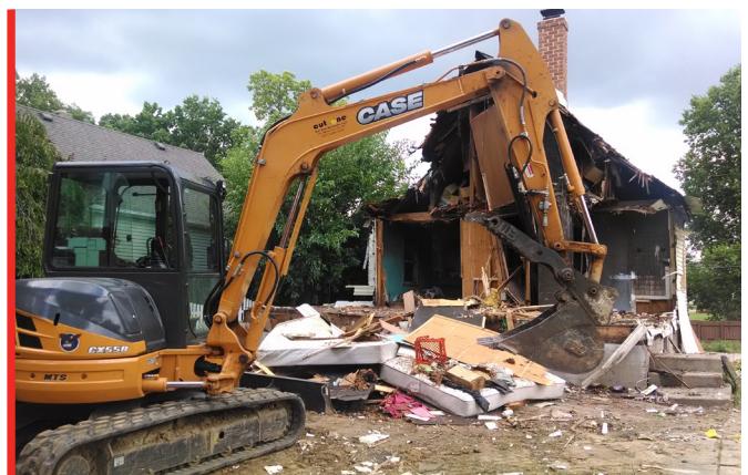
IN PROGRESS PHOTO OF DEMOLITION EFFORTS AT WHITE RESIDENCE

In addition, the renovation is in the early stages of demolition with framing scheduled to begin early next month.