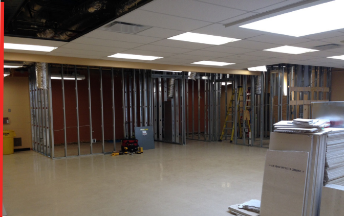
IN PROGRESS PHOTO OF CLASSROOM FRAMING

Earlier this month, Oberer Thompson Company began construction efforts on a classroom expansion at the Upper Valley Career Center (UVCC) in Piqua, Ohio.