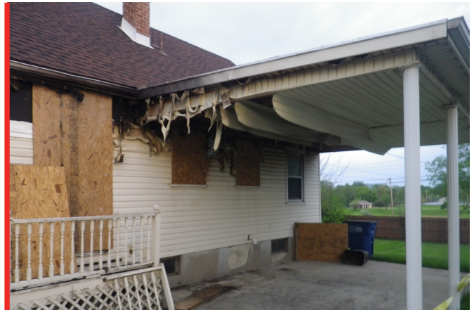
SIDE ELEVATION OF WHITE RESIDENCE AFTER TEMPORARY REPAIRS

Greater Dayton Construction Group's Emergency Response Team responded to the call, and quickly began work to temporarily secure the residence.