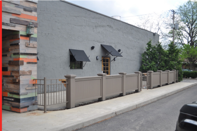
WHEAT PENNY BAR & OVEN BEFORE PATIO ADDITION

Located next to the Historic Oregon District in Downtown Dayton, Wheat Penny Oven & Bar offers a variety of California-style cuisine that patrons will now be able to enjoy on a new outdoor patio.