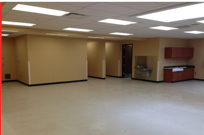
AFTER PHOTO OF RESTROOM / STORAGE & LOCKER- AREA (PRIOR TO FLOOR POLISHING)

Additional scope items included: plumbing and sanitary work, a build out of a locker room and storage area, as well as new VCT flooring, drywall, and paint.