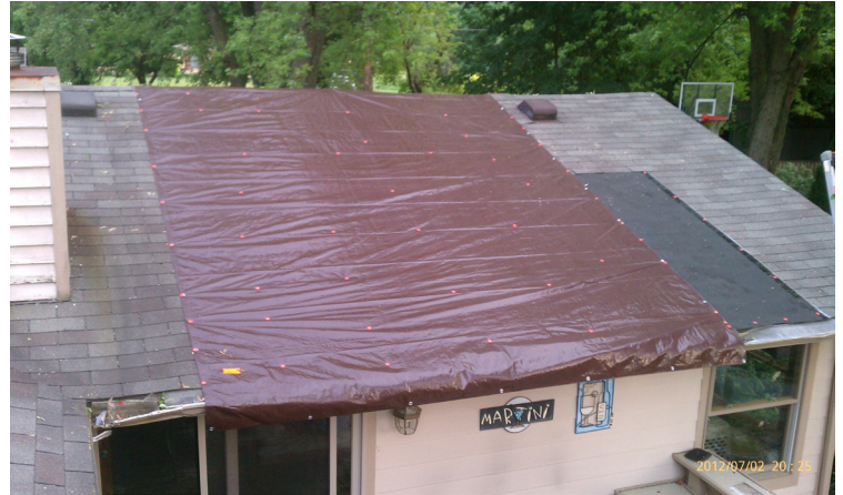
Temporary Repairs to Roof of Peters Residence

and weekends since the storms to respond to over 130 calls and has performed over 40 temporary board-ups for homeowners that have suffered damage to their property.