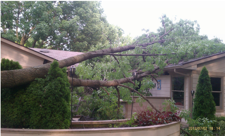
Wind / Tree Damage to Peters' Residence

Roger Peters, a local business owner, received extensive damage (see photo below) when high winds from the storms caused part of a tree to break off and land on the roof / back porch of his Beaver creek home.