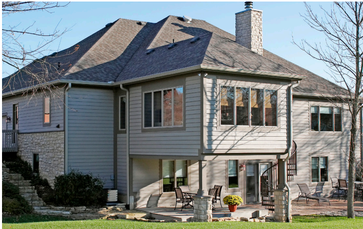
Room Addition at Klopfenstein Residence

The previous addition - built by GDB&R - to the Klopfenstein's home was completed in 2005 and functions as a sun room and entertainment space for the family.