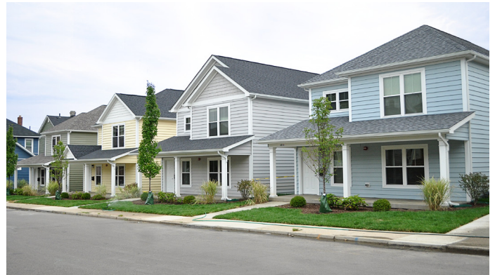
New Student Houses on the 400-Block of Lowes St.

All of the units have been ENERGY STAR Version 3.0 certified and have a HERS (Home Efficiency Rating System) rating of 48. A tankless, on-demand water heater, Spider (wet applied) blown in fiberglass wall insulation and a 96%+ AFUE furnace will all contribute to a reduction in utility costs for the University.