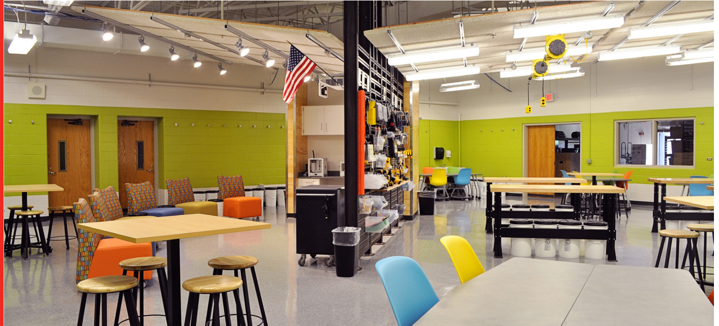
AFTER PHOTO OF DESIGN THINKING LAB AT ANKENEY MIDDLE SCHOOL IN BEAVERCREEK