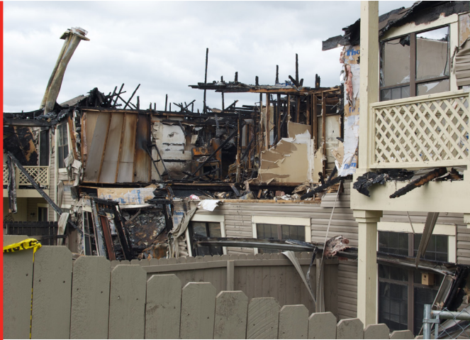
PHOTO OF REAR ELEVATION OF FAIRWAY LAKES APARTMENTS AFTER FIRE LOSS

As a result of the fire, the 12-unit, +/- 11,500 sqft. apartment building suffered extensive damage to the interior and exterior of its first and second floors.