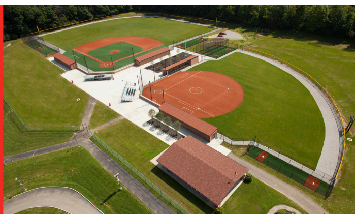
AERIAL PHOTO OF INDIAN HILL ATHLETIC COMPLEX