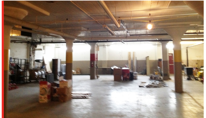
BEFORE PHOTO OF ST. VINCENT DE PAUL'S APPLE STREET LOCATION

Located on Apple Street in Dayton, OH, the renovations to SVDP's "Gateway Shelter for Women and Families" included the build out of 12 offices, a reception/lobby area, two conference rooms, kitchenette, and meditation room.