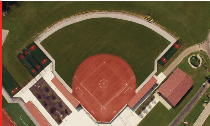
AERIAL PHOTO OF SOFTBALL FIELD AT INDIAN HILL HIGH SCHOOL

As part of GDCG’s ongoing marketing efforts and project documentation, we once again seized the opportunity to work with the company when it came time to capture photos of Indian Hill High School’s Athletic Complex in Cincinnati, Ohio.