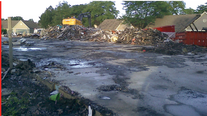
PHOTO OF FAIRWAY LAKES APARTMENT BUILDING AFTER DEMOLITION EFFORTS

To date, demolition is in progress and production is scheduled to begin later this Summer.