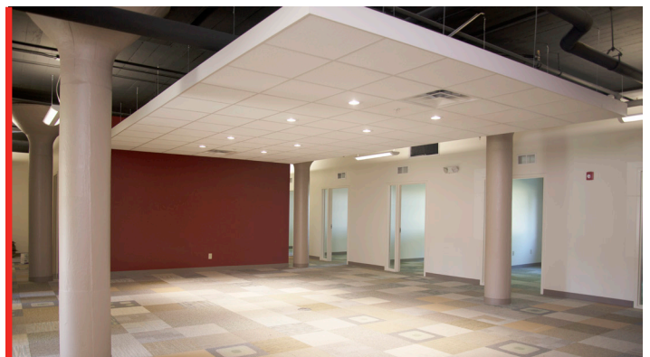
AFTER PHOTO OF SVDP'S RENOVATED APPLE ST. LOCATION

Additional renovations included new paint, drywall, shuffle carpet, ceiling cloud system, and HVAC upgrades.