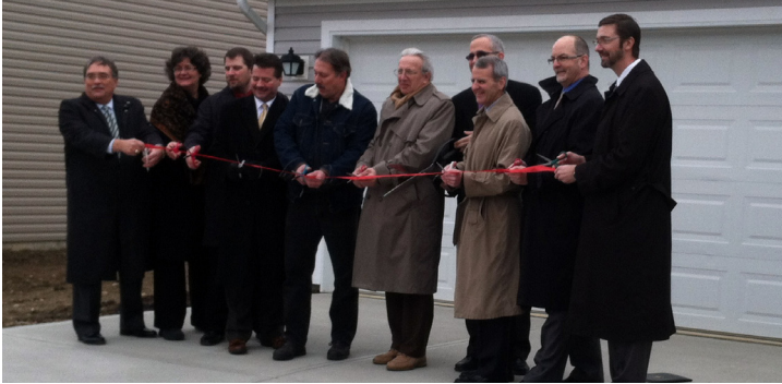
Ribbon Cutting Ceremony at Fort McKinley

On January 14 th , the Fort McKinley neighborhood, located in Harrison Township, held a ribbon cutting ceremony to kick off neighborhood improvement efforts.