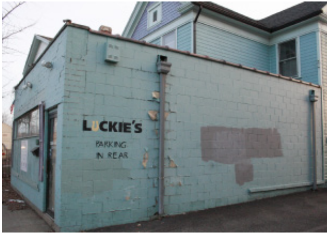
Exterior Commercial Space of Luckie's Before Renovations

Full Circle Development will be hosting an open house on February 11th from 5:00-8:00 PM to celebrate the completion of some much needed renovations to the old Luckie's Check-into-Cash building located at 1207 Wayne Avenue in the Historic South Park District (next to Ghost Light Cafe).