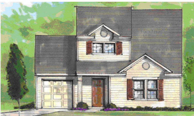
Fort McKinley Home Rendering –Rendering Courtesy of Gold Key Realty

Each of the homes have four bedrooms, two bathrooms and are equipped with the following amenities: covered front porch, one-car attached garage, full basement, Energy Star rated windows, central air conditioning, full-size Energy Star appliances, fully accessible kitchen, computer loft, and walk-in closet. Of the 25 homes, six are ADA accessible and feature a first-floor bedroom and lowered cabinet heights for easier accessibility.