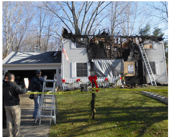
Ulmer Residence Fire Damage

GDCG, along with trade partners Puroclean and A-1 Fabric Restoration, were on site quickly and ready to help with immediate restoration efforts.