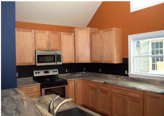
Kitchen in Renovated Apartment at 1207 Wayne Ave.

Improvements to the apartment include raised ceilings, new cabinets, flooring, deck and mechanicals.