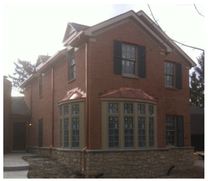
Progress Photo of Clark Residence Addition

The addition, approximately 2,400 sqft in size, features a new master bedroom with en suite and sitting room as well as a new laundry area on the first floor. The second floor includes three additional bedrooms and a full bathroom.