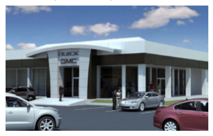
Medina Auto Mall Front Elevation Rendering —Courtesy of Illes Architects Inc.

The Medina Auto Mall – a Cadillac, Buick and GMC dealership – located in Medina, Ohio, is in the final stages of building renovations.