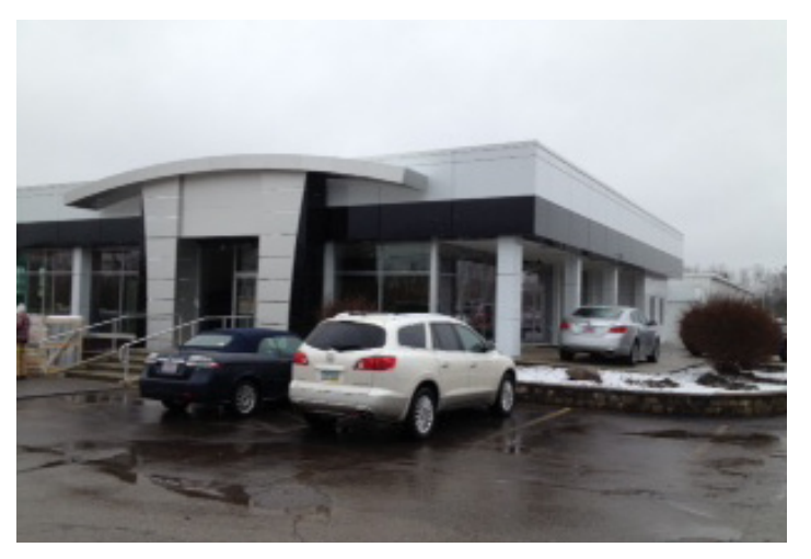
Progress Photo of Medina Auto Mall Front Elevation

The exterior project scope included: new ACM panels, signage, and pre-engineered limestone panels. Interior finishes included: new mechanicals, framing and drywall, millwork, ceiling tile, flooring and a new entrance area with welcome desk.