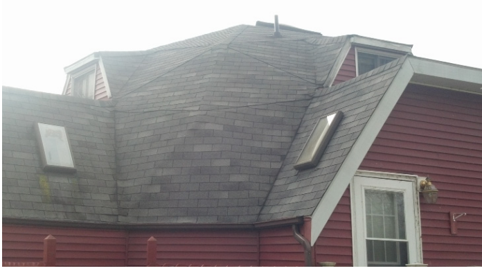
Geodesic Roof Damages at Grilliott Residence

GDCG was contacted by the homeowner after several other contractors were unable to take on the restoration project due to the complexity of the repair scope.