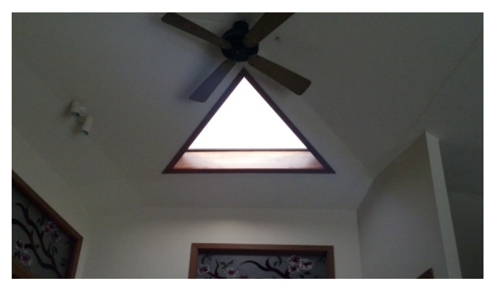
Custom Triangular Skylights in Grilliott Residence

Under the restoration scope, a new roof, ridge cap, customized triangular skylights and window well coverings will all be replaced.