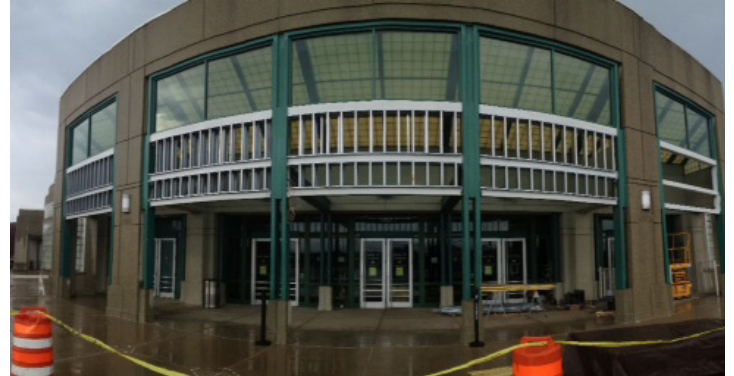
Progress Photo of Gate 3 Renovations at Ervin J. Nutter Center

The Ervin J. Nutter Center located in Fairborn, Ohio received several upgrades completed by Oberer Thompson Company to one of its exterior entrance gates.