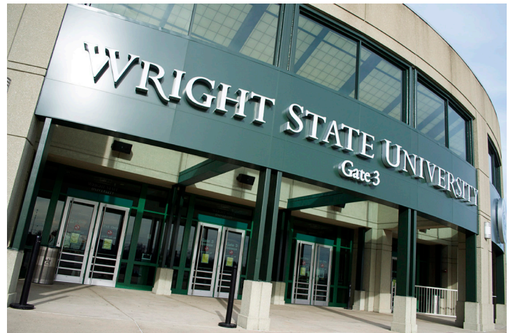
Upgraded Signage on Entrance of Gate 3

The project's scope included demolition of the existing metal panels, new metal stud framework, new paint, and electrical work. Once the metal panels were replaced, new signage was installed.