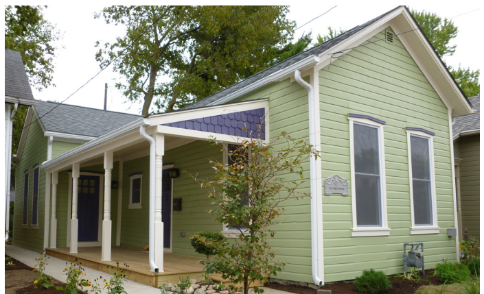
Front Elevation of 634 Oak St. After Renovations