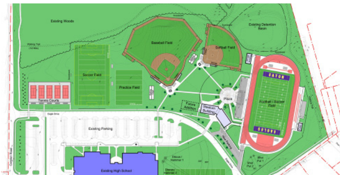
Site Plan for Eaton Community's Athletic, Wellness and Arts Facility

The project's scope includes the build out of a new synthetic running track and turf football field, as well as grandstands complete with press box. In addition to the stadium build out, the project will also include a 10,400 sqft block building which will house the home/visitor locker rooms, concessions, trainer and coaches rooms and a multi-purpose room. From an architectural standpoint, the building symbolizes an "Eagle" layout, after the school's mascot.