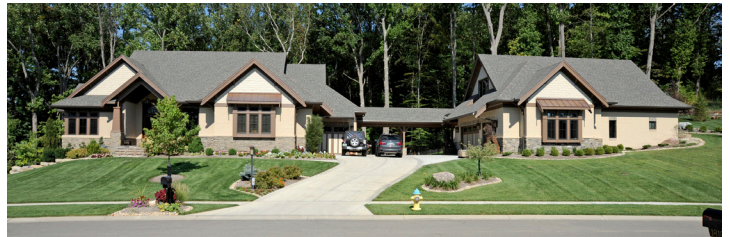
Front Elevation of Herres' Carriage House

that didn't involve leaving the neighborhood and was easily accessible and monitored. Construction on the carriage house / pool area began in November of 2011 and was finished in May of 2012.