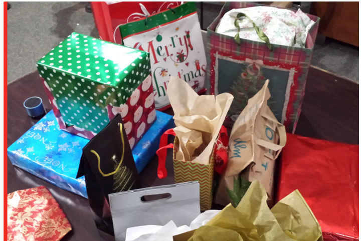
PHOTO OF GIFT SELECTION AT THE WHITE ELEPHANT GIFT EXCHANGE