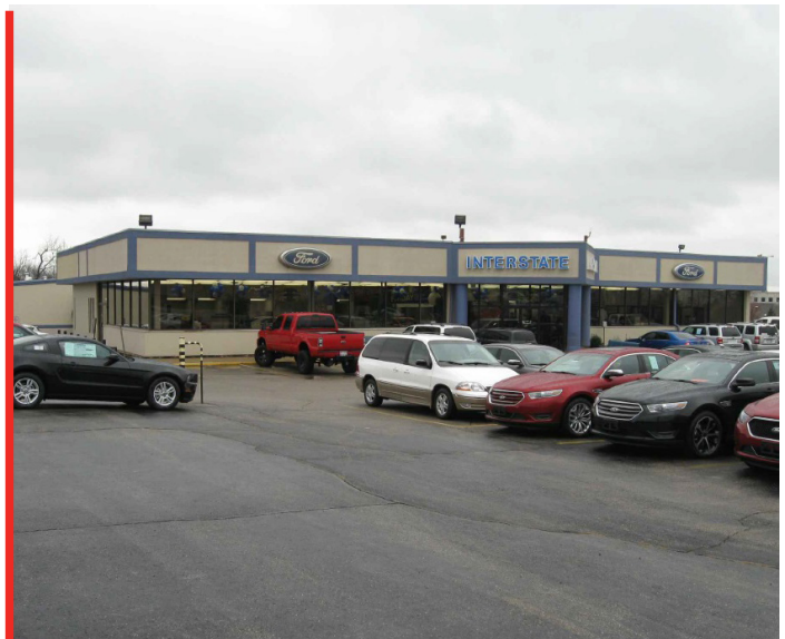
BEFORE PHOTO OF INTERSTATE FORD’S FRONT ELEVATION

Additionally, the building’s exterior now features a new facade using a combination of ACM (Aluminum Composite Material) Panels and EIFS (Exterior Insulation Finishing System). The key architectural element to the new storefront is the archway entrance — known as the “Ford Tower” — exclusive to Ford dealerships.