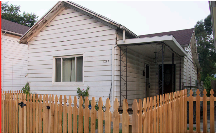
BEFORE PHOTO OF 637 OAK STREET

Full Circle Development, a Beavercreek-based development company, aspires to “restore and revitalize older neighborhoods one house at a time”.