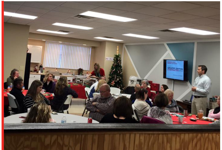
CE COURSE ATTENDEES LISTEN IN ON THE LECTURE

The course was hosted at AllServ's main office and focused on property evaluation and the current state of residential remodeling.