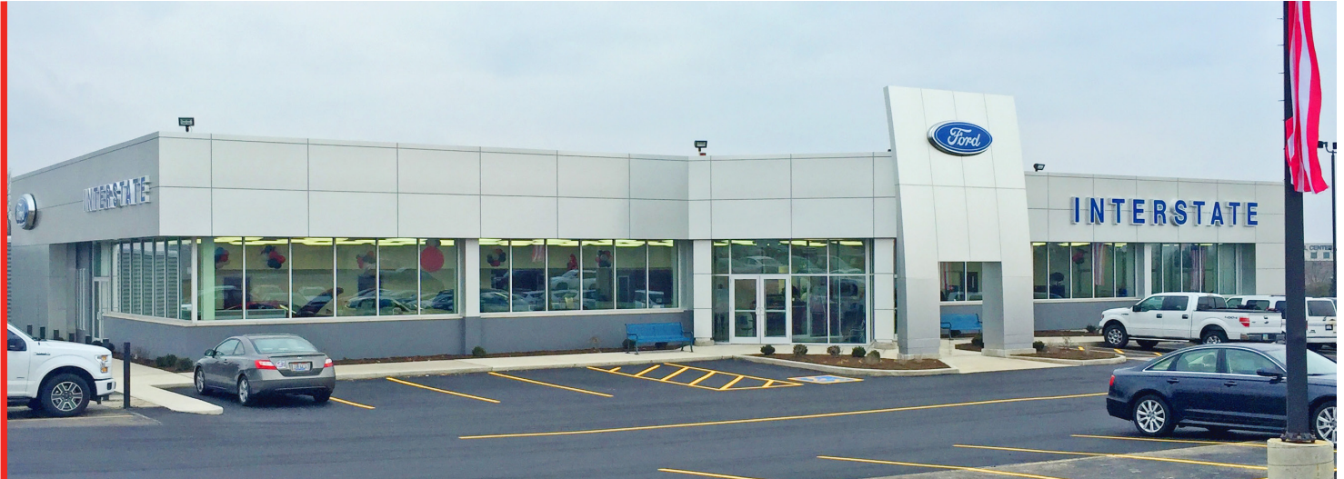
FRONT ELEVATION OF INTERSTATE FORD IN MIAMISBURG AFTER RENOVATION EFFORTS