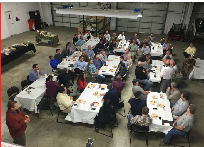
GDCG / OTC EMPLOYEES GATHER FOR THE HOLIDAY APPRECIATION BREAKFAST