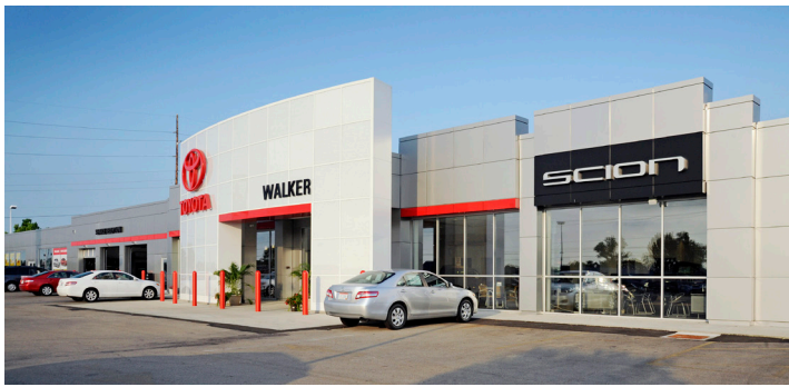
Walker Toyota's New Building Facade after Renovations

For Walker, ACM (Aluminum Composite Material) Panels were used to clad the exterior of the building. New storefront windows and overhead doors were installed. Three colors of ACM panels were used to complement the Toyota branding and signage. Renovations also included, the addition of a 1,015-square-foot space added to the sales floor to house a new vehicle delivery area.