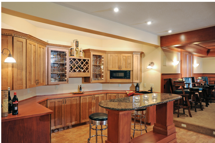
Updated Kitchenette, with New Granite Island in Bockelman Basement

At the Bockelman residence, an underutilized basement was turned into a media room / home theatre space. The existing open-joint ceiling was replaced with a wood coffered ceiling, old tile was replaced with high efficiency cork flooring and granite counter tops were used for the island and floating bar tables.