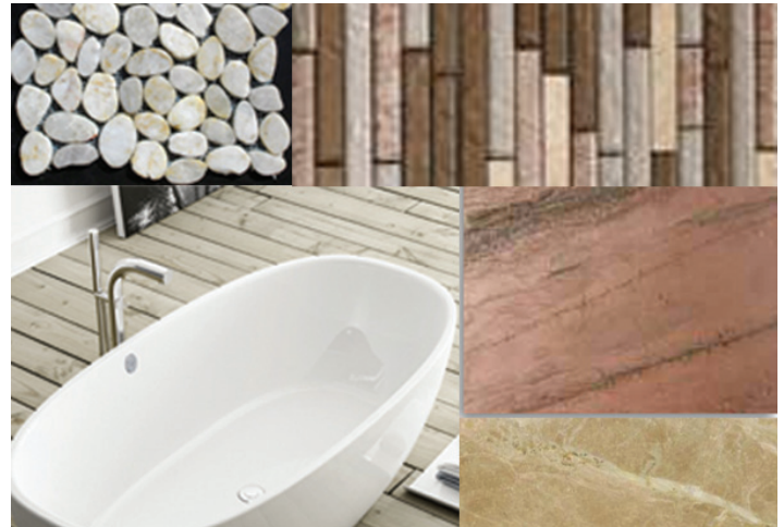
Contemporary Selection Samples for Wood's Master Suite -Selection Images Courtesy of Jennifer Luckoski

For the second-level addition, walls will be removed and ceilings will be vaulted to provide more light for the open space. Luxurious finishes will be used to create new focal points for the area.