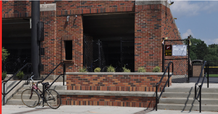
AFTER PHOTO WITH NEW PLANTER BOX AND STAIR SETS

The school's exterior improvement scope included: the installation of two new stair sets with handrails (one with bike ramp) and planter bed with seat wall.