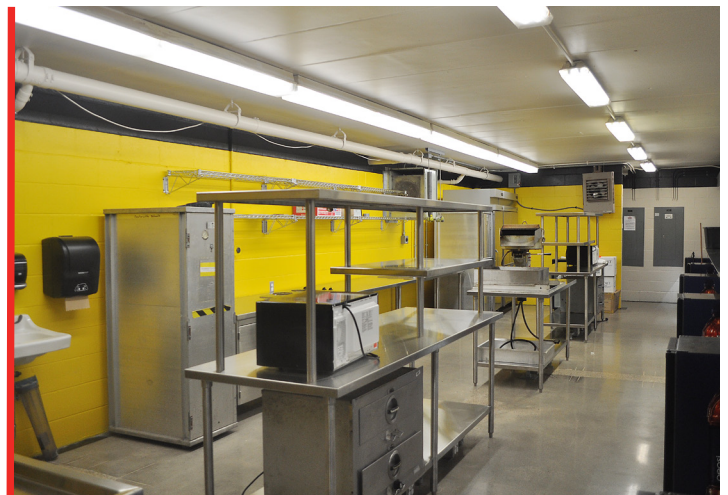
PHOTO OF CONCESSION STAND AFTER RENOVATION EFFORTS

Renovations to the concession stand included: custom fabricated stainless-steel countertops, new overhead doors (for the order windows), new electrical and plumbing systems, shelving, cabinetry, and a refinished concrete floor. In addition, OTC painted the space black and yellow to keep with the school spirit!