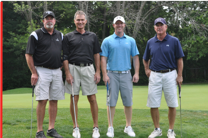
1ST PLACE TEAM, VOLK PAINTING (2), POSES FOR A PICTURE DURING THE GOLF SCRAMBLE

Greater Dayton Construction Group and the Oberer Thompson Company held its 11th annual golf outing at Walnut Grove Country Club on Monday, August 11. The four-man scramble format featured 34 teams with approximately 135 golfers participating in an afternoon session. Teams battled to compete for 1st/2nd/3rd and a “friendly skins” game.