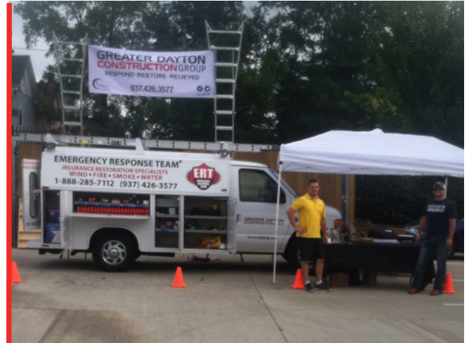
GDCG DISPLAYS THE EMERGENCY RESPONSE VEHICLE DURING THE CINCINNATI RED CROSS DISASTER FAIR

On Saturday, August 23, the American Red Cross Cincinnati-Area Chapter and Hamilton County teamed up to host a Disaster Preparedness Fair. Over 30 agencies were present to help show families how to respond during and after a disaster, along with steps families can take to prepare for a safe response plan. During the fair, families learned how to create disaster kits using items already found in their home.