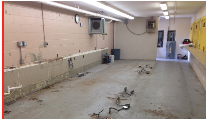
PHOTO OF HOME-SIDE CONCESSION STAND AFTER DEMOLITION EFFORTS AT CENTERVILLE HIGH SCHOOL FOOTBALL STADIUM

To prepare for the upcoming sports season, Centerville High School contracted Oberer Thompson Company in early July to provide renovations to their home-side concession stand at Centerville Stadium.