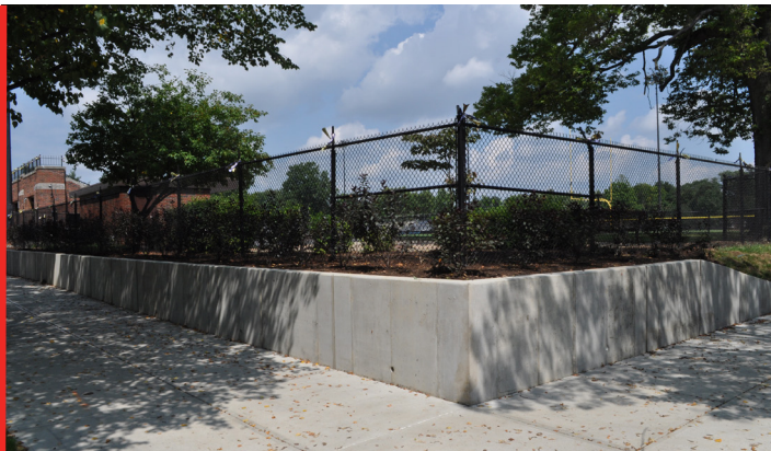
AFTER PHOTO OF OAKWOOD HIGH SCHOOL WITH RETAINING WALL

Additionally, OTC oversaw the installation of a retaining wall (approx. 200 lineal feet) as well as 1,200 sqft. of sidewalk.