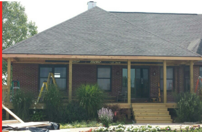
IN PROGRESS PHOTO OF COVERED PATIO AND DECKING AT HUBBARD RESIDENCE

To date, the covered patio and deck are in place and the project is scheduled for completion in September.