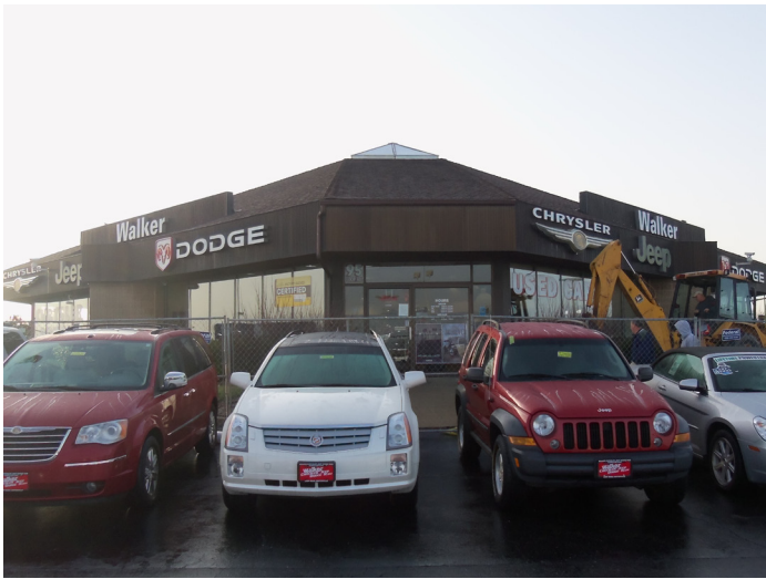
Before Photo of Exterior Elevation to Walker Chrysler Dodge Jeep Ram

In response to its corporate facility's image program changes, Walker Chrysler Dodge Jeep Ram, located on Loop Road in Centerville, is in the final stages of building renovations.