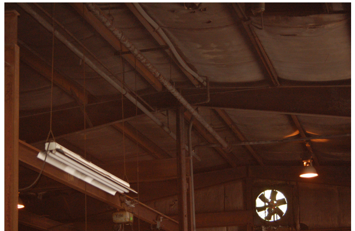
Smoke and Fire Damage to Insulated Ceilings

GDCG has been awarded the project which includes: replacing damaged insulated ceilings, all ventilation, exhaust and duct work, replacement of three chemical tanks and liners as well as soda blasting to all steel framework in the 7,000 square foot structure.