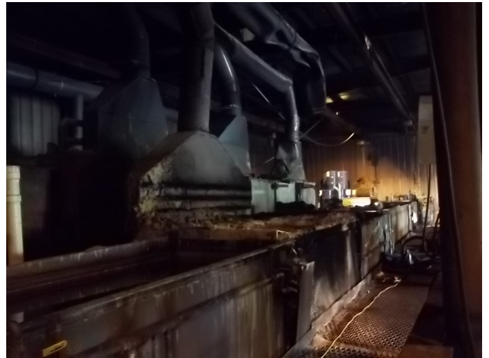
Acid Tank, Rinse Tank and Black Oxide Tank Which Caught Fire at Quality Steel Corporation

Chemicals / fumes are believed to have started the initial fire which spread rapidly through the building.