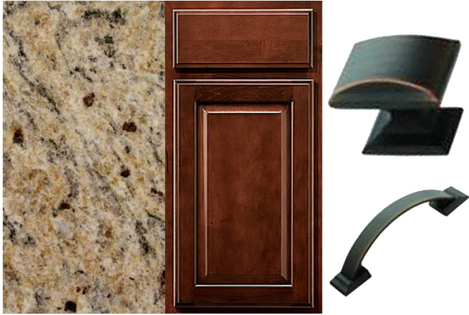
Selections for Arnold Kitchen Remodel

Monika and Perry Arnold's existing kitchen lacked the form and function they desired. They came to Greater Dayton Building & Remodeling wanting a rejuvenated kitchen complete with additional cabinetry, granite countertops and a large island to accommodate food preparation and additional seating.