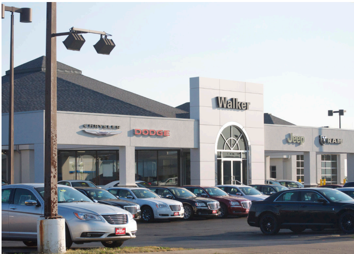
Newly Renovated Exterior Elevation of Walker Chrysler Dodge Jeep Ram

The new store front will help provide the necessary additional signage space for the dealership group.