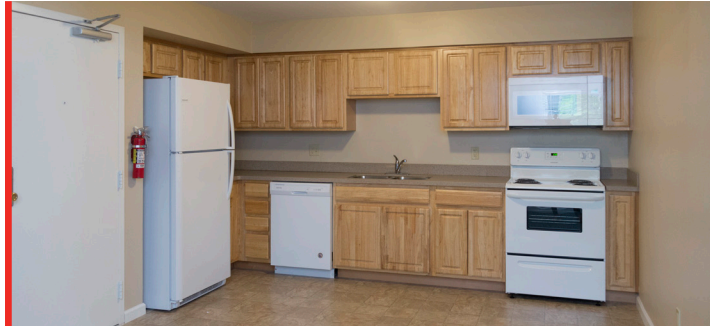
AFTER PHOTO OF KITCHEN IN GARDEN APARTMENT

GDCG has also completed the restoration/renovation of three units at 365 E. Stewart Street Garden Apartments. Each space received mechanical upgrades, as well as an improved floor plan (removed partition walls) and interior upgrades to the kitchens and bathrooms.