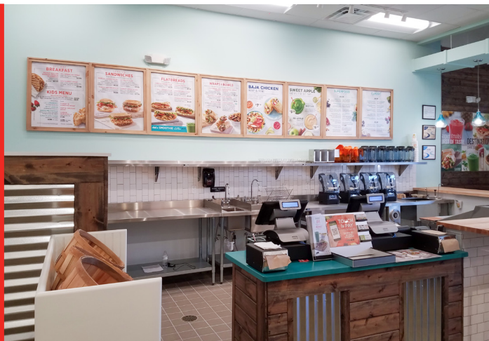
POINT OF SALES AREA AT TROPICAL SMOOTHIE EASTGATE

This project is GDC, Ltd.'s latest in an ongoing relationship with the Tropical Smoothie franchise, having previously completed renovations/tenant improvements at seven other locations.