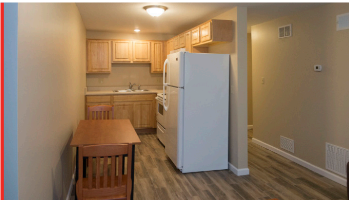
AFTER PHOTO OF KITCHEN AREA AT 819 IRVING

The +/- 10,500 sqft. apartment also received improved lighting in the common corridors, structural reinforcements, and widened drive lanes.