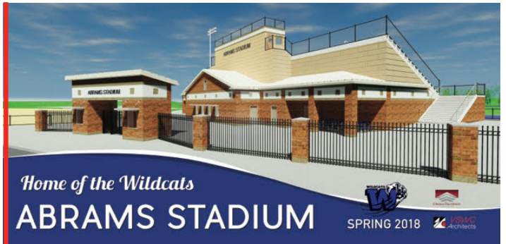
RENDERING OF ABRAMS STADIUM -RENDERING COURTESY OF VSWC ARCHITECTS

The new facility will be known as "Abrams Stadium," after a local family's generous donation helped make the project possible.