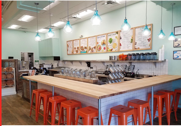
NEW "SMOOTHIE BAR" AT TROPICAL SMOOTHIE EASTGATE

Greater Dayton Construction, Ltd. recently completed a tenant improvement project for the latest Tropical Smoothie franchise in Cincinnati, Ohio.