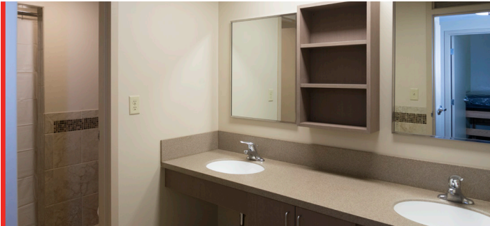
AFTER PHOTO OF BATHROOM RENOVATION IN VWK SUITE

Renovated units received bathroom upgrades, new living room entertainment centers, and updated closet shelving systems. Since 2015, GDCG has renovated 20+ VWK units.