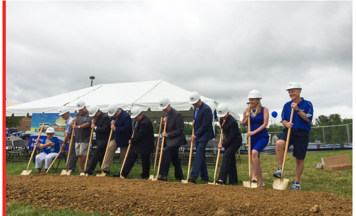
GROUNDBREAKING CEREMONY AT WILLIAMSBURG

Williamsburg School District — along with staff, students, and community leaders — held a groundbreaking ceremony on Monday, Aug. 7 to mark the beginning of construction on its new stadium project.