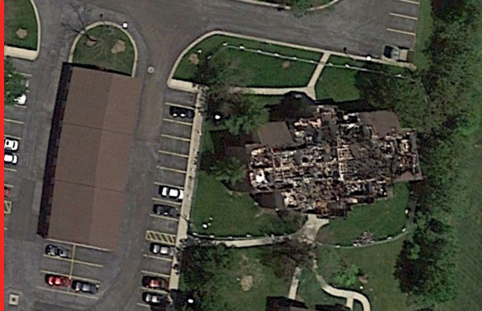
AERIAL PHOTO OF CONIFERS APARTMENT COMPLEX AFTER FIRE LOSS - PHOTO COURTESY OF GOOGLE MAPS

In May of 2014, Greater Dayton Construction Group's Emergency Response Team responded to a fire loss at the Conifers Apartment community in Miamisburg, Ohio.