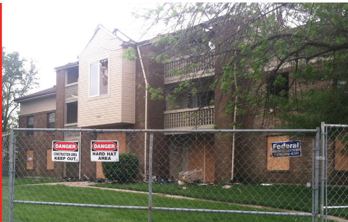
CONIFERS APARTMENT COMPLEX AFTER EMERGENCY SERVICES

While code upgrades and unforeseen hazardous material challenges arose during the project's production phase, GDCG's team worked diligently to ensure the restoration was completed on-time and within the limitations of the owner's insurance policy.