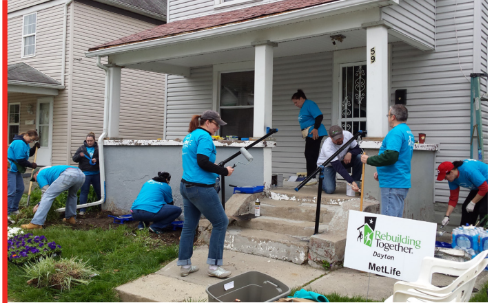
VOLUNTEERS HELP WITH RENOVATIONS DURING NATIONAL REBUILDING DAY 2015