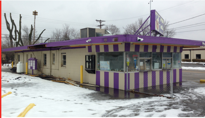
EXTERIOR OF DIXIE DAIRY DREAM AFTER FIRE LOSS

In February, the Dixie Dairy Dream ice cream shop in Dayton, Ohio suffered extensive damage when its boiler system ignited, causing a fire to spread quickly throughout the building.