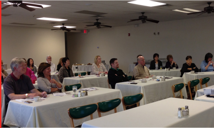
MIAMI VALLEY INSURANCE PROFESSIONALS ATTEND CE COURSE

The courses were hosted at Reflections in West Alexandria and focused on water damage mitigation and effective claims management.