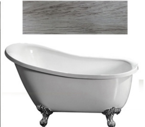
PROPOSED MASTER BATHROOM SELECTIONS