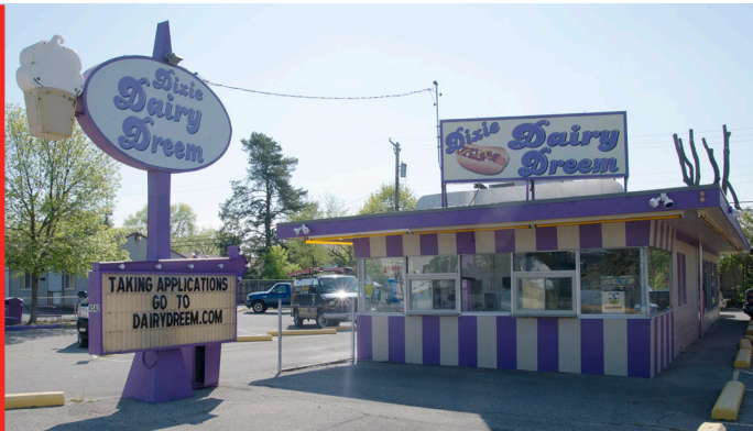
FRONT ELEVATION OF DIXIE DAIRY DREAM AFTER RENOVATION EFFORTS

To date, GDCG is in the final stages of production and the ice cream shop is expected to reopen (for the summer season) in early May.