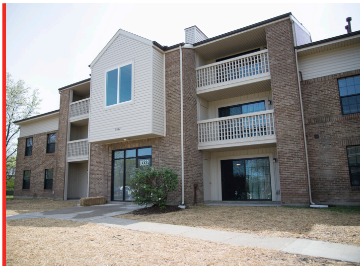
REAR ELEVATION OF CONIFERS APARTMENT COMPLEX AFTER RESTORATION EFFORTS - PHOTO COURTESY OF CAROLINE MORGAN